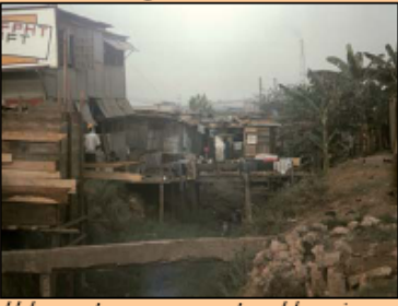
Urban water management problems in Accra

SWITCH is an acronym for the FP6 Integrating Project called "Sustainable Urban Water Management Improves Tomorrow's City's Health". SWITCH is one of the largest environmental research projects funded under FP6. It aims at the development, application and demonstration of a range of tested scientific, technological and socio-economic solutions and approaches that contribute to the achievement of sustainable and effective urban water management schemes in 'The City of the future' (projection 30-50 years from now). The approach will be to develop efficient and interactive urban water systems and services (city level) in the context of the city's geographical and ecological setting (river basin level), which are robust, flexible and adjustable to a range of global