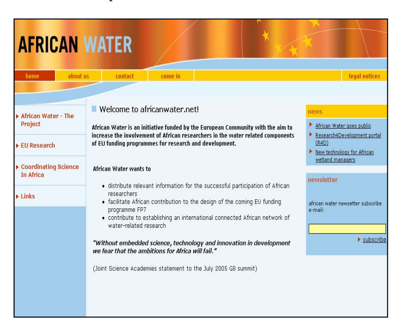
Figure 1.1 Home page of the African Water website www.africanwater.net at launch in June 2006.

Appendix 1 shows the African Water brochure (D1.1.3), available in English, French and Portuguese, and Appendix 2 shows the project poster. All these items can be downloaded from the African Water website. Exhibition display material, available in English and French, is also available.