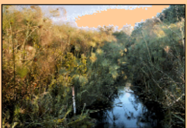
Water level monitoring in the delta (photo

TWINBAS project partners DHI Water and Environment, CEH and Rhodes University and have been working closely with the Permanent Okavango River Basin Water Commission (OKACOM) and stakeholders in the basin. To increase understanding of the hydrology of the delta and the impacts on the delta of changes in climate and of developments such as population growth and dams in the upper reaches in Angola, various climate change and land-use change scenarios in the upper basin have been fed into Rhodes University's Pitman rainfall-runoff model and CEH's GWAVA Global Water AVailability Assessment model to produce flow series which can be fed into the MIKE-SHE/11 integrated hydrologic model of the delta itself.