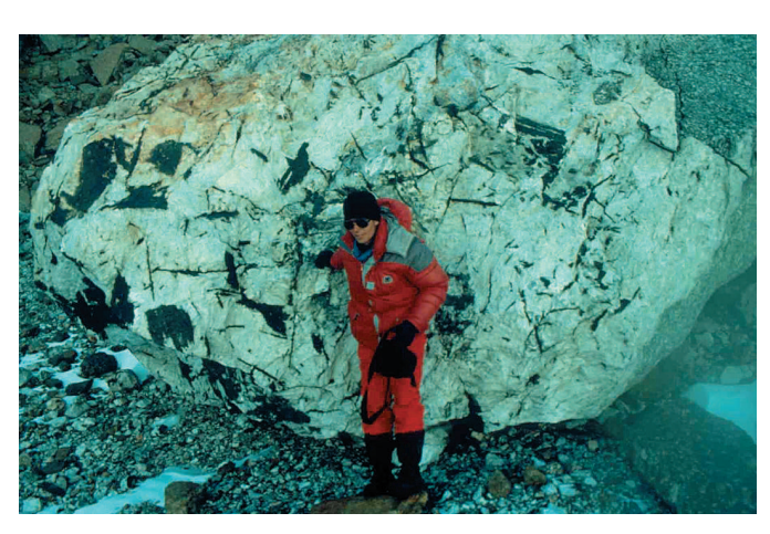
Fig. 3: Very coarse-grained pegmatite, eastern Vardeklettane.

Abb. 3: Riesenkörniger Pegmatit, östliches Vardeklettane.