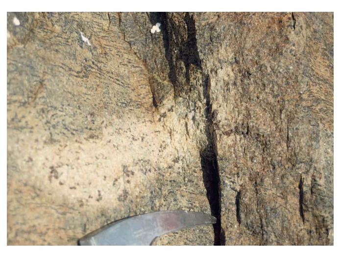
Fig. 2: Dehydration melting patch in leucogranite gneiss (above hammer head), western Vardeklettane.

Abb. 2: Helle Flecken im Leukogranit-Gneis, die Entwässerungs-Schmelzen bei hochgradiger Metamorphose anzeigen; westliches Vardeklettane.