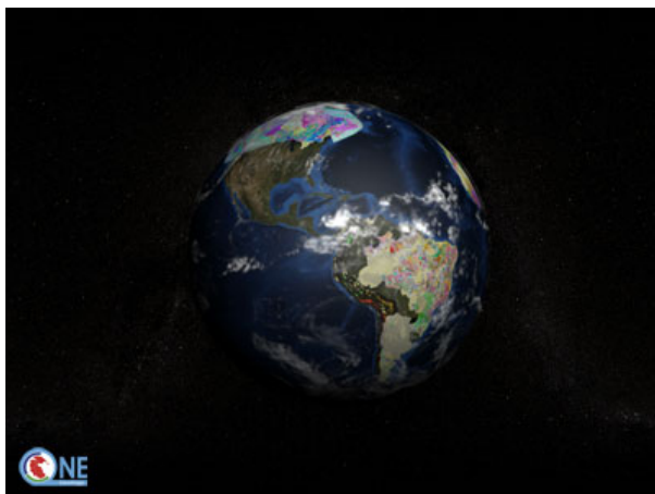
Figure 1. Geological data from across the world in real time

On 6 August 2008, at the opening of the 33 rd International Geological Congress in Oslo, Simon Winchester, author of the best-selling book about the English geologist, William Smith and his “Map that changed the world”, launched the web portal of a global project called OneGeology. Had you used the term OneGeology 32 months earlier – or typed it into Google - you would have registered a blank. The project and its name did not exist. So what is this project that appeared from nowhere in 2006 and took centre stage at the IGC in 2008?