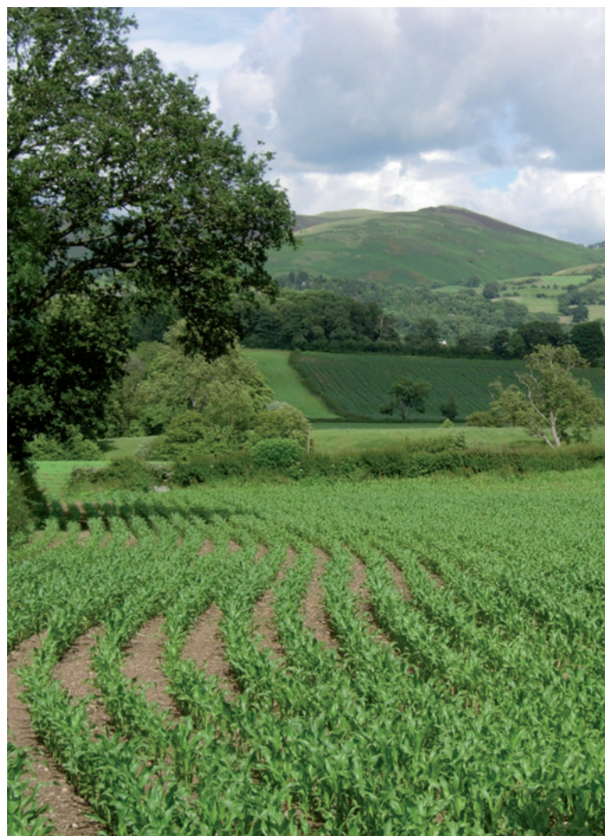
▲ Young maize, Clwyd

The Arable & Horticulture and Improved Grassland Broad Habitats are among those most likely to change in both area and condition over time, because their management is so responsive to the economics of farming, the introduction of new technologies and to changes in agricultural policy.