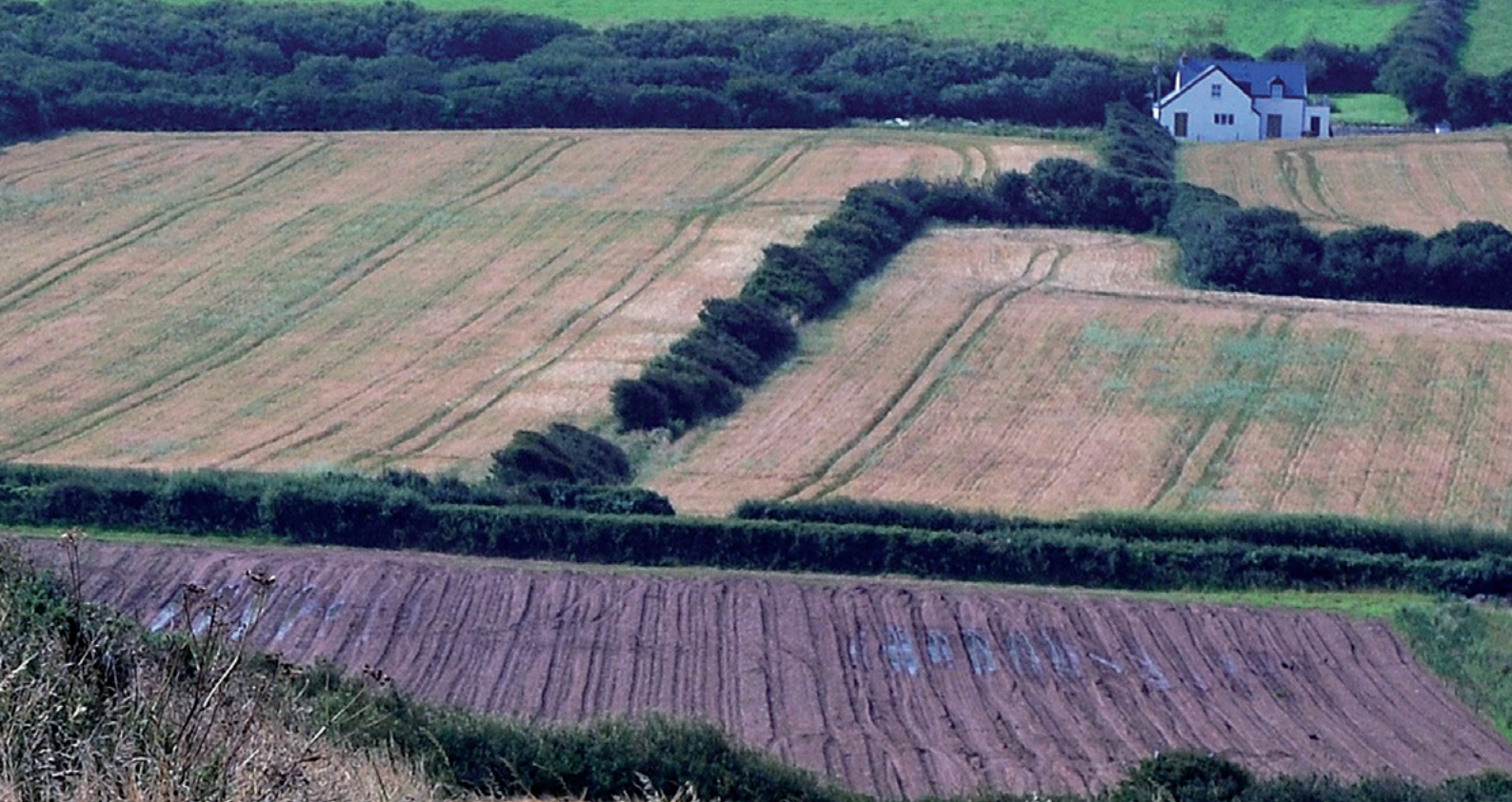
▲ Enclosed farmland • © Clive Hurford