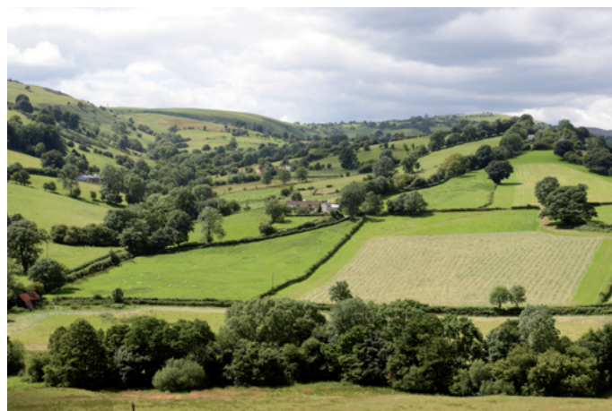
▲ Pass above Dinas Mawddwy

All but one of the significant changes were based on medium or small standardized effect sizes suggesting minor impacts on the vegetation. The only large effect size in the Improved Grassland Targeted Plots was the reduction in Stress Tolerator Score in the upland zone between 1990 and 1998 ( Table 2.6 ). This highlights a substantial decline in the contribution of this sensitive species group. The effect size for the overall change between 1990 and 2007 was 0.7, just below the criterion for a large effect (0.8) 24 but indicating that a possibly important decline was seen over the whole 17 year period covered by the three surveys ( Table 2.6 ).