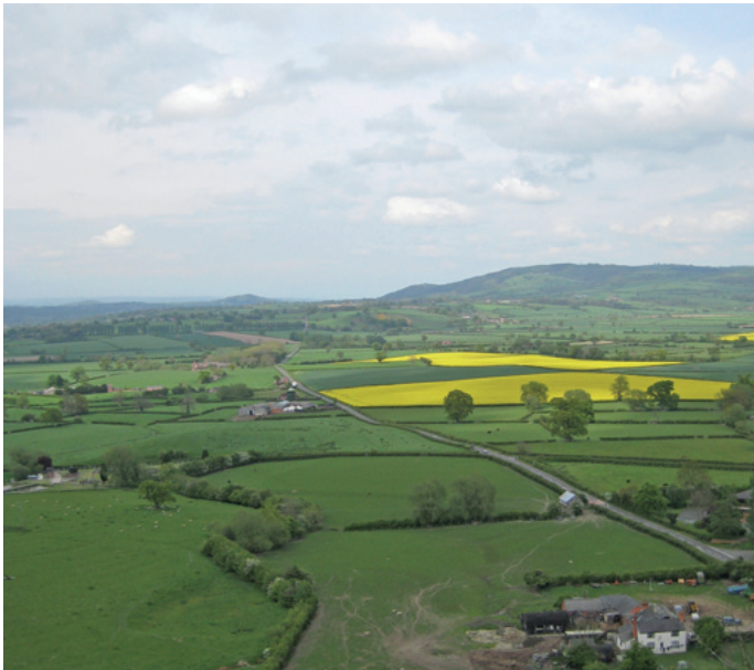
▲ Enclosed farmland, Montgomeryshire • © David Allen

In comparing estimates of extent from Countryside Survey with the Habitat Survey of Wales, perhaps especially the extent of Arable & Horticulture, account must be taken of the long interval between the different surveys. Agricultural statistics for the period 1992-1997 (coinciding roughly with the period during which Habitat Survey of Wales surveyed lowland Wales) show the area of arable fluctuating between 68,000 and 76,000 ha, consistently higher than the Habitat Survey of Wales estimate. The Countryside Survey estimate is higher than that shown in Agricultural Statistics though the Agricultural Statistics figure falls within the 95% confidence interval of the Countryside Survey estimate, as does the Habitat Survey of Wales figure ( Table 2.7 ). There is some difference between surveys in how they treat temporary grasslands, and this is likely to have contributed to some degree to differences in estimates of the extent of arable.