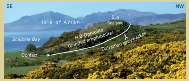
Banded amphibolite layer of the HBO, in sheared thrust contact with right-way-up Dalradian rocks. Dun Scalpsie, Isle of Bute.