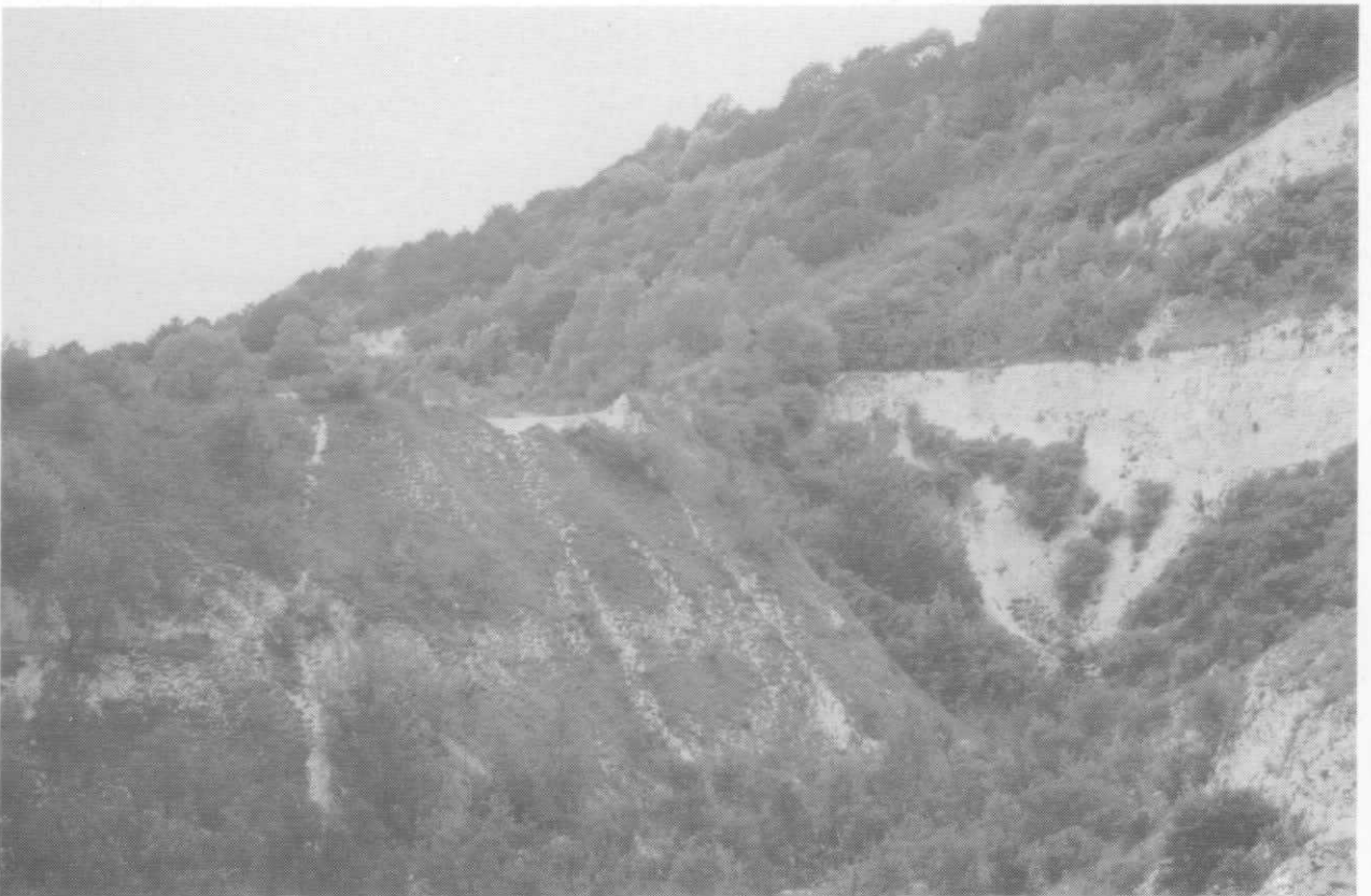
Plate 3 Face (right) and spoil mound (left) at Betchworth quarry, Surrey in 1975