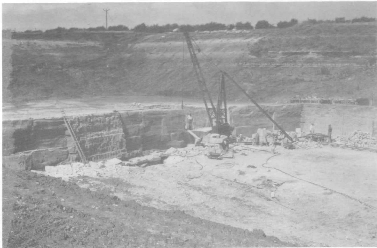
Plate 1 Overburden and face of Glebe quarry, Ancaster, Lincolnshire in 1975