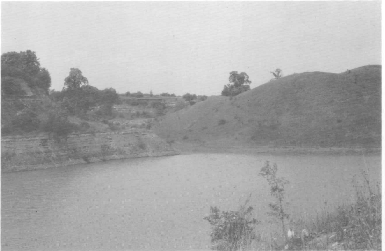
Plate 2 Limestone face, spoil mound and lake at Stockton quarry, Warwickshire in 1975