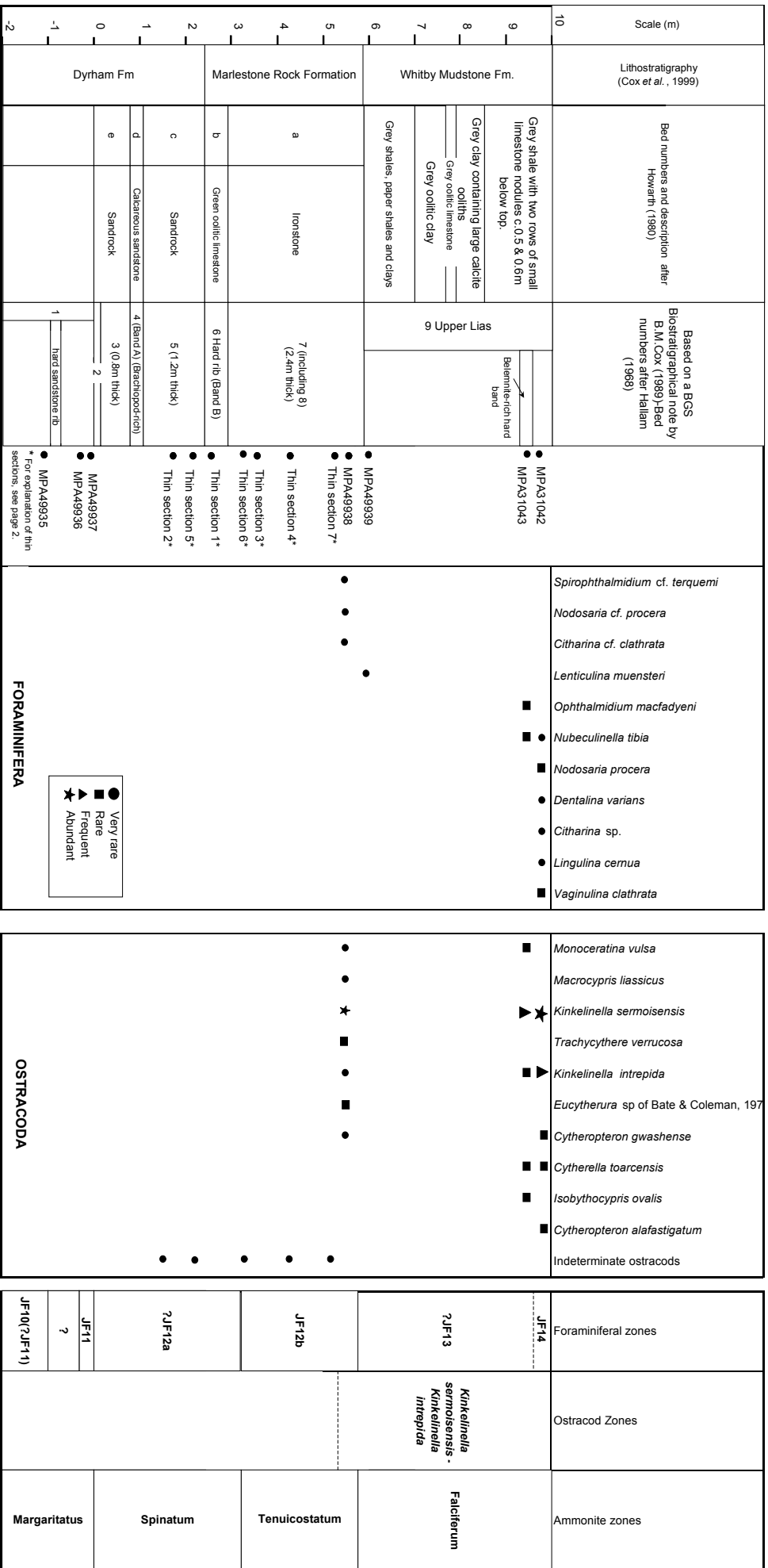
Text Figure 2. Distribution of Foraminifera and Ostracoda in the Tilton Railway Cutting