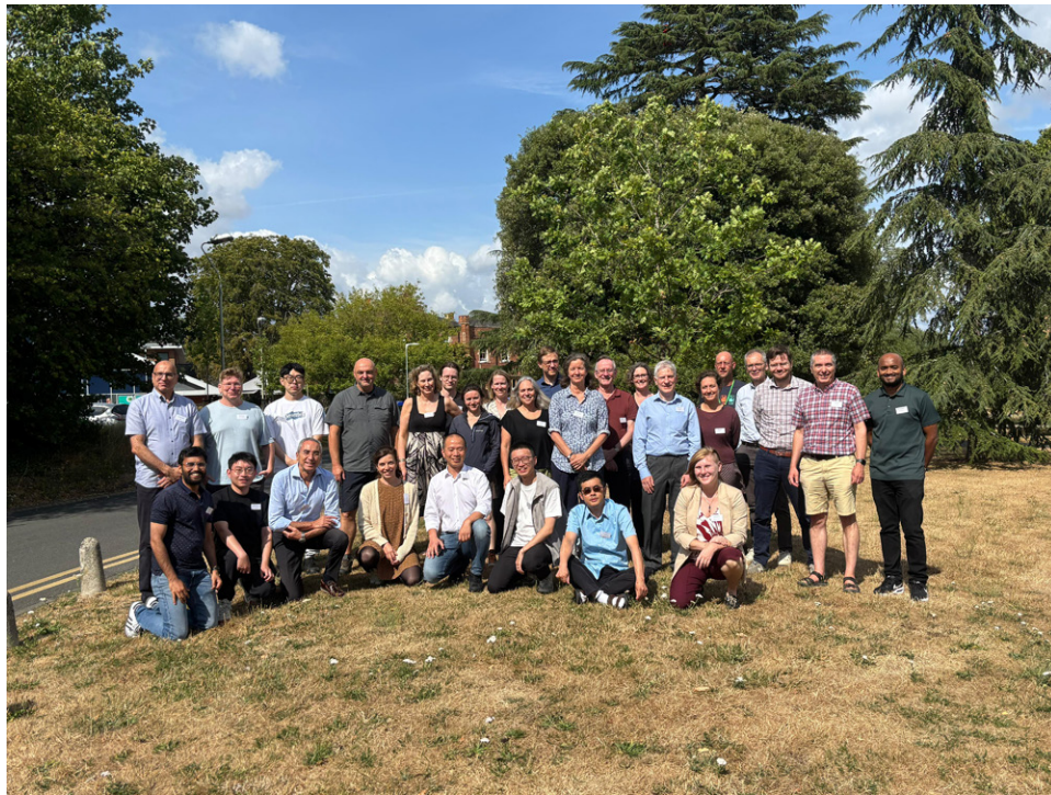
FIG. 1. SoilWat_2025 group photo, Whiteknights Campus, Reading University, 14 Jul 2025.

soil structure (Fatichi et al. 2020; Bonetti et al. 2021), and soil biophysical feedbacks (Robinson et al. 2019), among others.