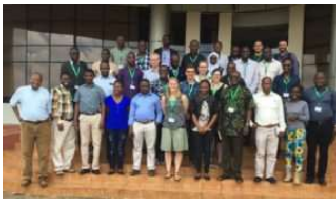
GCRF African SWIFT Sub-seasonal Testbed participants at the kick-off event, Ngong, Kenya, November 2019

Through a Real-Time Pilot Initiative of the World Meteorological Organisation (WMO) Sub-seasonal to Seasonal Prediction Project, the GCRF African SWIFT sub-seasonal forecasting testbed has brought together forecast producers, researchers and forecast users in tropical Africa, to develop sub-seasonal forecasts through a forum approach. Prototype forecast products are co-produced and operationally trialled in real-time using forecast data from the European Centre for Medium-Range Weather Forecasts (ECMWF), for the first time. Launched in November 2019 in Ngong, Kenya, the testbed provides an opportunity for close collaboration between participants to support the co-production of useful (actionable and skilful), tailored sub-seasonal forecasts.