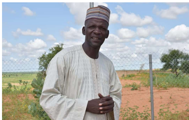
A farmer from Yobe state reports benefits of the sub-seasonal rainfall prediction.