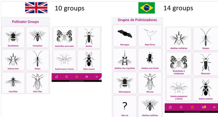
Figure 1. Pollinator groups in the UK and Brazil.

After installation, users may select in which country the observations will be conducted and their preferred language, either English or the main native language of participating countries. The adaptation of the application for use by Brazilian citizen scientists involved not only the translation of the interface, but also relied on the expertise of a local team who helped select which plant species and pollinator groups would be appropriate and representative of biodiversity within the country (Fig. 1). The application is supported by a website that features a dedicated page for each country. Users can download the app on Google Play or App Store (Fig. 2).