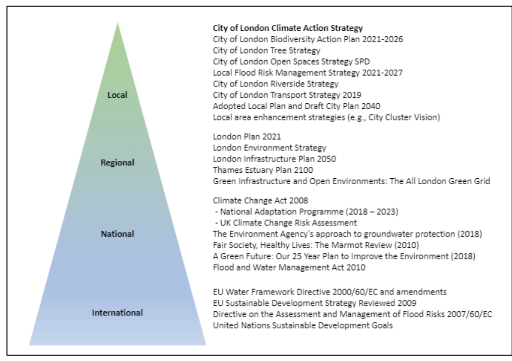
Figure 2 Examples of climate related policies applicable to the City of London Corporation

<u>Local Plans</u> are prepared by Local Planning Authorities to guide planning decisions in their area, and are required to address climate change and sustainable development, guided by <u>National Planning</u> <u>Policy Framework</u>. These include the requirements for local authorities to <u>adopt proactive strategies</u> to <u>mitigate and adapt to climate change</u>. However, these plans do not address the strategic planning of subsurface space to support climate adaptation .