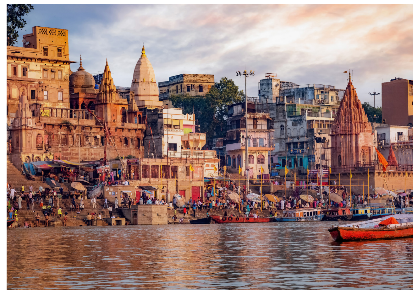
Varanasi, along the River Ganges.

A shift in focus from water supply management to water demand management is needed (Jain 2019; NITI Aayog 2019). In many cases, an over-reliance on groundwater for drinking and irrigation is causing significant declines in groundwater levels and groundwater quality across India, yet much of the irrigation in place for food production is wasteful (FAO 2015; Jain 2019). Part