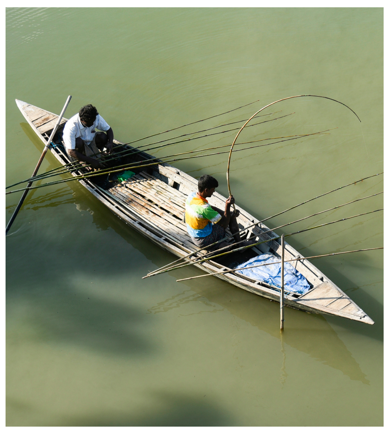
Fishermen in Barpeta district, Assam.

step forward to looking at water as a whole and not its separate parts (Chaturvedi 2012; Jain 2021). Similarly, the establishment and monitoring of the Composite Water Management Index by the National Institution for Transforming India (NITI Aayog), which has outlined the current status of water resources as well as the performance by States, is another important development. NITI Aayog (2019) recommends the use of data-based decision making, which could prompt States and