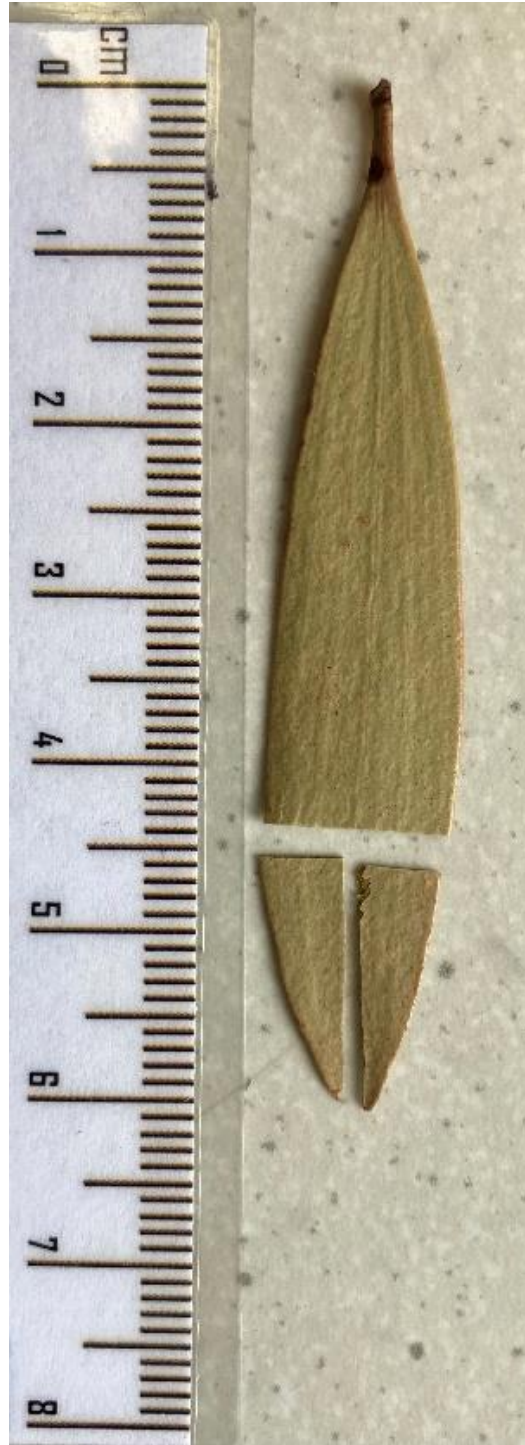
Figure 1) Example of a leaf sample analysed in this study. Leaf tips were cut, with half of the sample homogenised by freezer-milling and the other half by ball-milling.