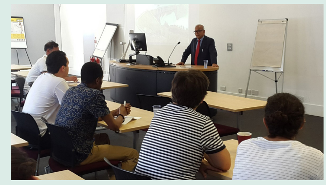
Figure 3. Seminar at Cranfield University

India is often said to be a hydraulic civilization, where growing food in arid climates was linked to management of water resources. The practices of irrigation in India have evolved over the last two millennia; technological development and public policies have enabled India to become the second most irrigated country, feeding a population of more than 1.25 billion. A threefold increase in irrigated area and greater than fivefold increase in agricultural production is no doubt commendable, but it has come at a huge cost in terms of degradation of natural resources and reduction in ecosystem services, introducing an element of unsustainability. How to make the irrigated production system sustainably compliant to meet the promises enshrined in "Future we want-healthy people and healthy ecosystem" is the issue (UN, 2012). Fortunately, there are a number of technological, economic, regulatory and policy based options to increase the resilience of water resources. There is very strong empirical evidence to show that increasing land and water productivity through various agrotechnological interventions and their mainstreaming in public development programmes can minimize the projected water demand and supply gaps.