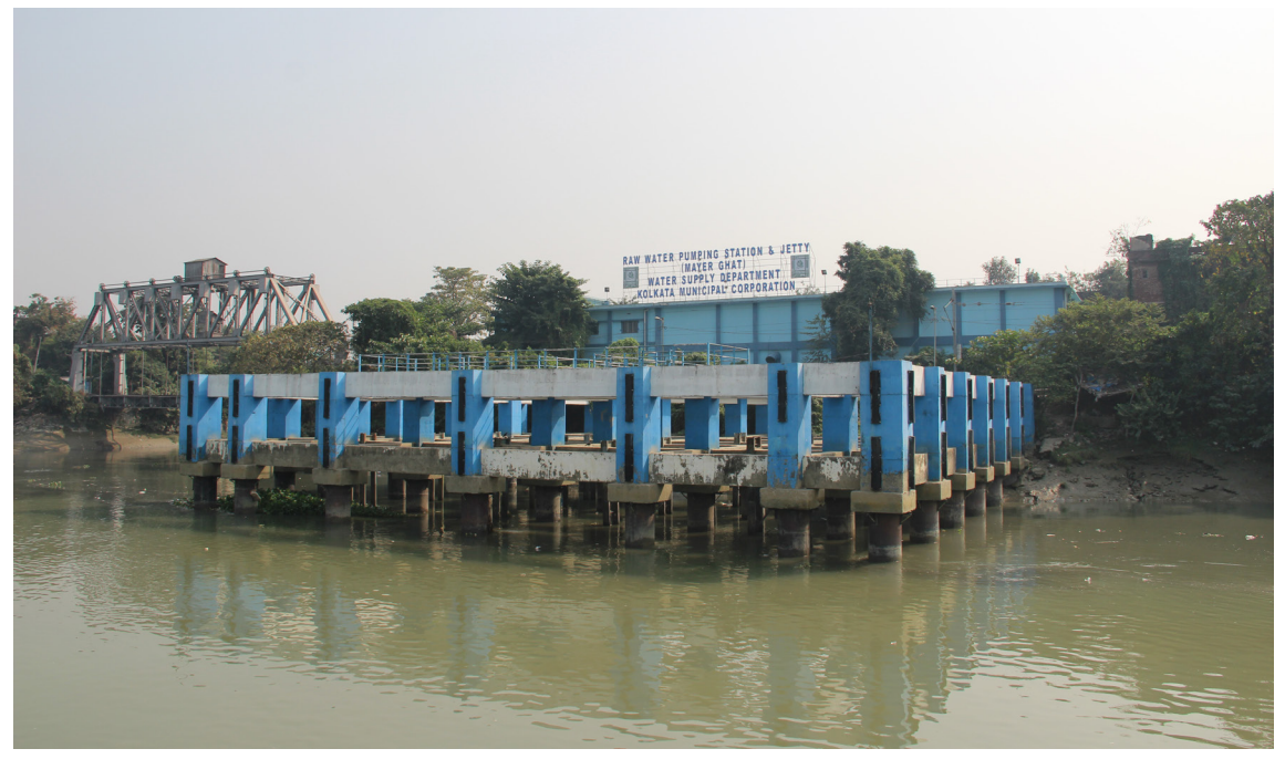
Fig 1. Raw water abstraction point, Bagbazar.

Water quality in the Hooghly River is assessed every month at 10 monitoring stations (Berhampore, Nabadip, Tribeni, Palta, Serampore, Dakshineswar, Garden Reach, Howrah Shibpur, Uluberia, Diamond Harbour)<sup>2</sup>. The monitoring stations have been selected to provide a good coverage