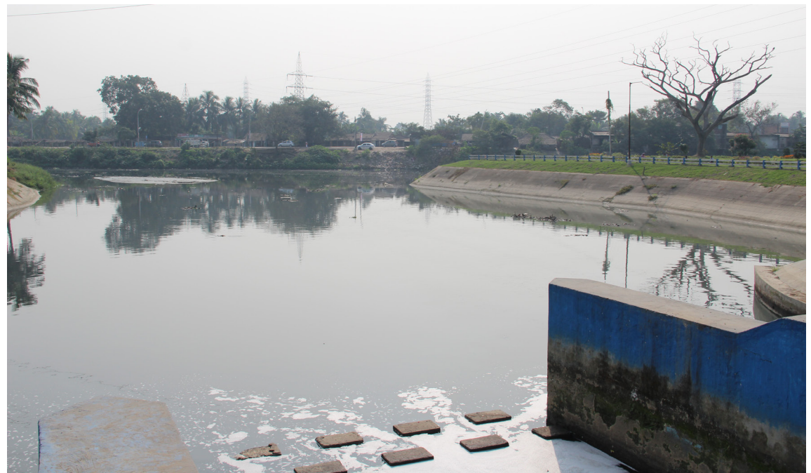
Fig 4. Canal water used to supply the East Kolkata wetlands and fisheries

though they may not be evident in the water column. In addition, the group members critically discussed on non-point sources which has being polluted the river and expressed to design a management framework to control such unidentified pollution at source itself.