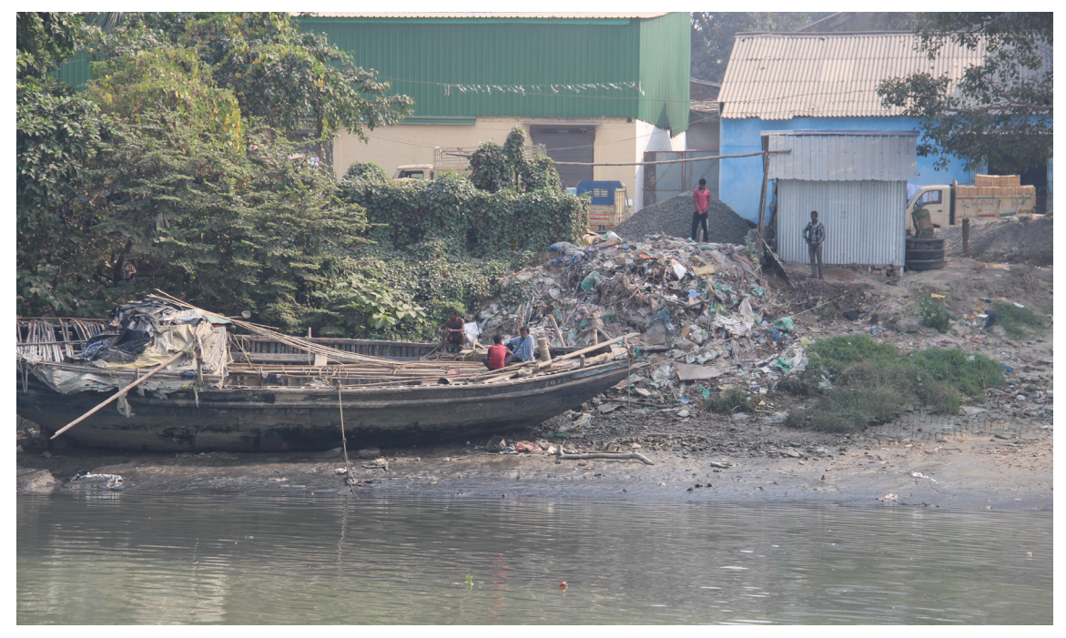
Fig 2. Dumping of waste on riverbanks.

Additional concerns are based on the potential combination of pollution from small scale industries with organic sewage, which is likely to lead to biotransformation and change in speciation of contaminants, and thus potentially increase the risk. Furthermore, for many contaminants there is the potential that they may become combined with sediments leading to legacy effects even