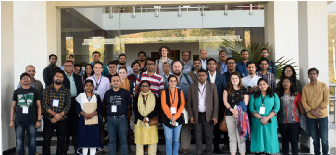
Figure 1: Delegates of UEI at IISER Bhopal Visitor Hostel (Event Venue)