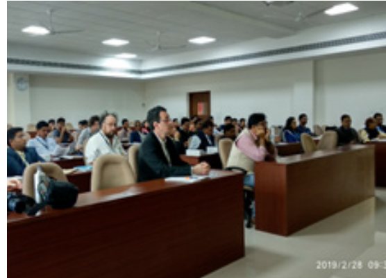
Figure 3: Inauguration of the UEI and audience