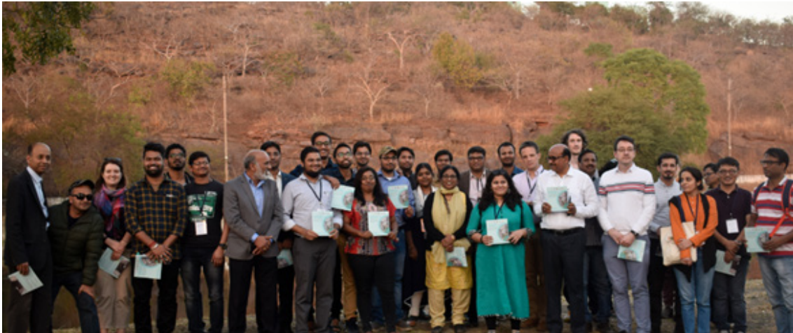
Figure 2: Visit to sewage treatment plant in Bhopal