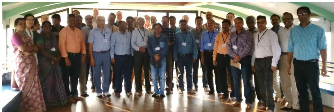
Figure 1: Delegates of the UEI on field visit to Vembanad Lake

This report outlines the structure, participation, presentation and discussion sessions undertaken during the course of the event. The report is intended for the workshop participants, India-UK Water Centre members and stakeholders.