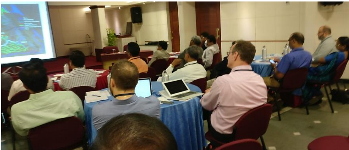
Figure 3: A look at UEI discussion sessions