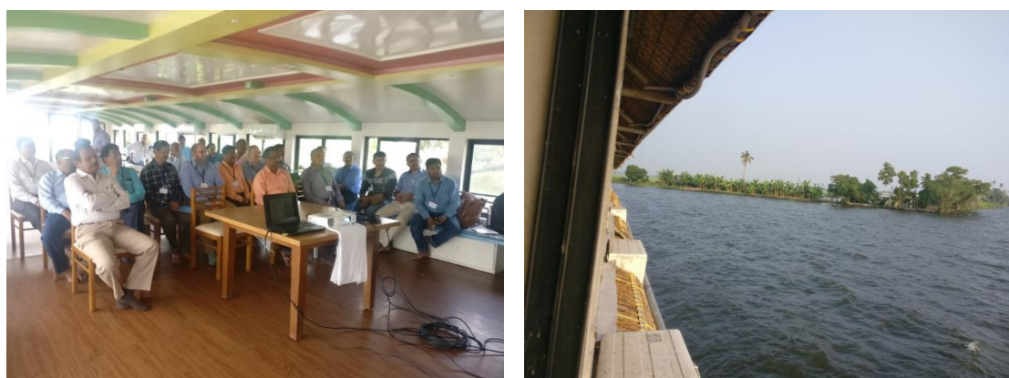
Figure 4: Field visit

The delegates were encouraged to consider how the technology discussed in the first four sessions of the UEI could be applied on ground to mitigate the impacts on the pristine ecosystem. To further this discussion there were demonstrations of the efficiency of in situ instruments like WISP–M, passive sensors for monitoring of optical and qualitative parameters from the lake and a demonstration of the applicability of SALTMED model as a tool for efficient use of water, crop, and fertilizers to the delegates (copies of the model software were also provided to the delegates).