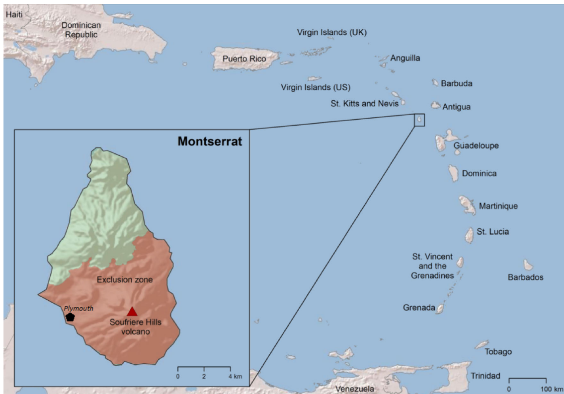
Fig. 1 Montserrat (inset) and its position within the wider Caribbean region.

preparedness and an absencing of risk in daily life. That process highlights the contradiction faced during the post-disaster recovery process and the challenges for learning from the disaster in order to reduce people's vulnerability.