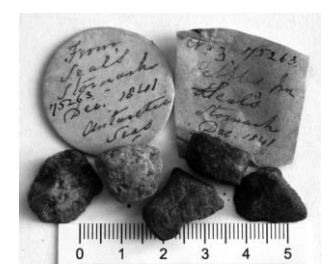
Figure 5. Pebbles recovered by McCormick from the stomach of a seal killed off East Antarctica in December 1841. Scale in cm. NHM specimen BM 75263 (Ross Collection). Photograph by Philip Stone. Image prepared for publication by Brian McIntyre, British Geological Survey, Edinburgh.

Figure 4. The impressions of tentaculitid shells (arrowed), accompanied by brachiopod impressions, in two of McCormick's fossil specimens from the Falkland Islands. The coin has a diameter of 1.8 cm. NHM specimens BB 19001, 19007. Photographs by Philip Stone. Image prepared for publication by Brian McIntyre, British Geological Survey, Edinburgh.