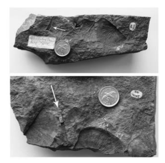
Figure 4. The impressions of tentaculitid shells (arrowed), accompanied by brachiopod impressions, in two of McCormick's fossil specimens from the Falkland Islands. The coin has a diameter of 1.8 cm. NHM specimens BB 19001, 19007. Photographs by Philip Stone. Image prepared for publication by Brian McIntyre, British Geological Survey, Edinburgh.