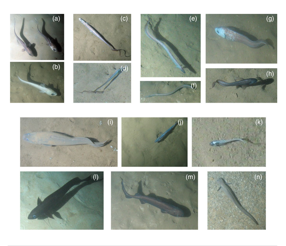
FIGURE 2 Example images of the fish morphotypes observed from each family during the present study. (a,b) Macrouridae (cf. Coryphaenoides spp.); (c,d) Halosauridae (cf. Aldrovandia spp.); (c,f) Synaphobranchidae (e: Synaphobranchus cf. kaupii ; f: Ilyophis cf. brunneus ); (g,h) Ophidiidae (h: cf. Dicrolene sp.); (i): Bythitidae ( Cataetyx cf. laticeps ); (j) Ipnopidae ( Bathypterois spp.); (k) Liparidae; (l) Moridae ( Antimora rostrata ); (m) Squalidae ( Centroscymnus squamosus ); (n) Zoarcidae ( Pachycara cf. crassiceps )

total of 6,783 and 5,920 photographs, respectively (Figure 2; Table 1). The temporal GAM that best fit the test data from the NF indicated a recurrent, bimodal intra-annual pattern (Figure 3a; Table S2), with the highest fish abundances occurring in late November (Julian day 327) and a smaller, secondary peak occurring in June (Julian day 163). Inter-annual variation in counts was not well predicted by the training data, and the residual variability remained high (Figure 3a). Despite the lower numbers of fishes observed at the FF, a positive correlation was identified between the FF fish counts and the predicted values from the NF GAM ( t -value = 3.04, p = 0.002).