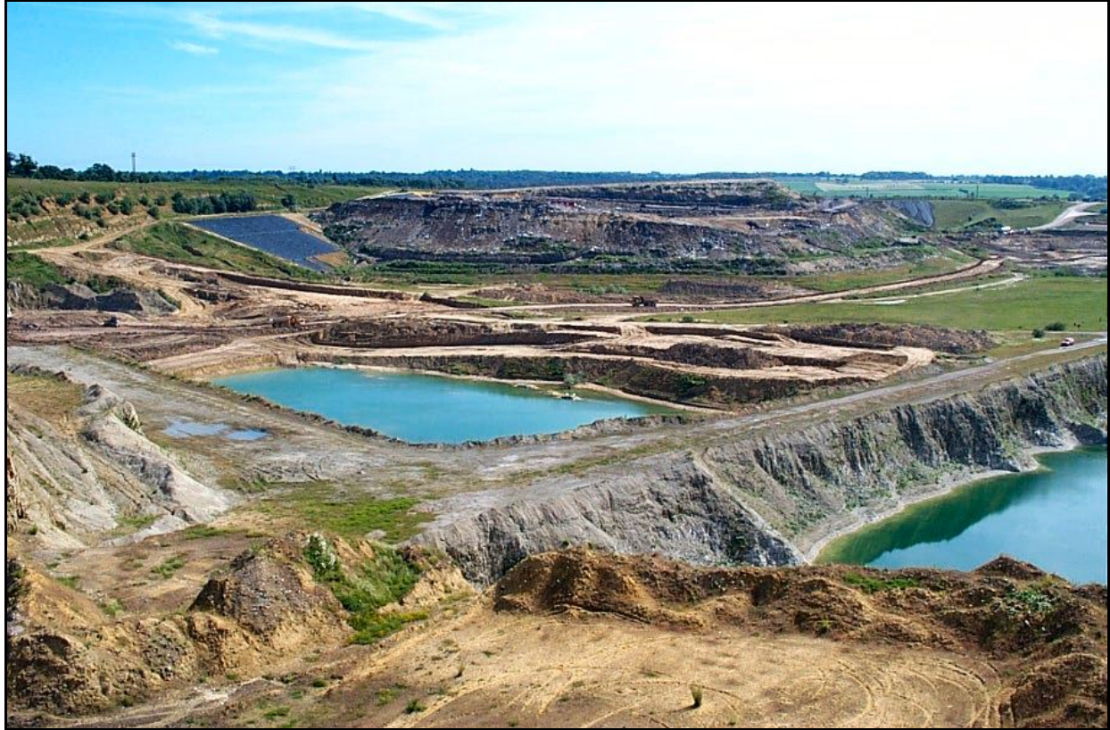
Figure 6 The quarry at Masons Cement Works, Great Blakenham. Now used for landfill

Until recently the Chalk was extracted on a large scale for cement manufacture at Masons Cement Works, Great Blakenham. This quarry, however, closed in 1999 and the site is now used for landfill. Chalk is currently extracted at several sites in the county, but on a relatively small scale, for the production of agricultural lime.