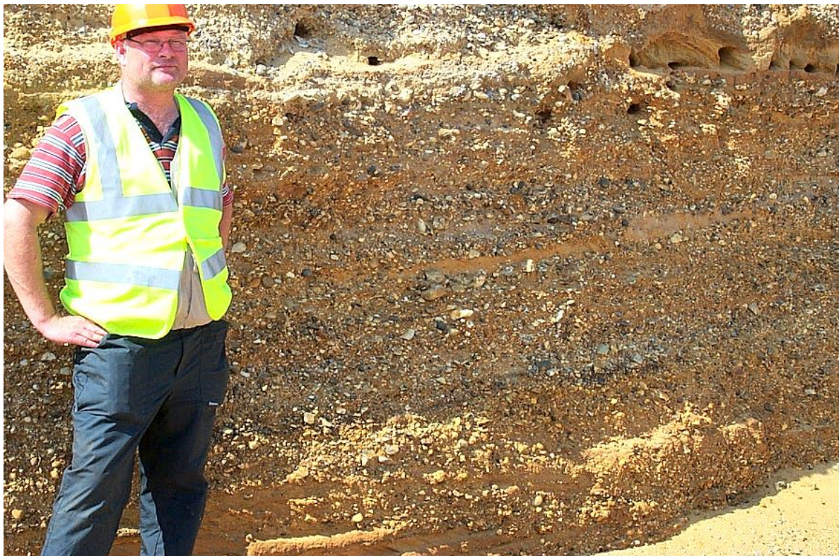
Figure 2 Kesgrave Formation sands and gravels, Waldringfield Heath

The deposits were laid down during successive cold phases between about 1.5 and 0.5 million years B.P. (up to the beginning of the Anglian glaciation) in braided rivers; the main swathe represents ancestral deposits of the River Thames which formerly flowed northeast across the area.