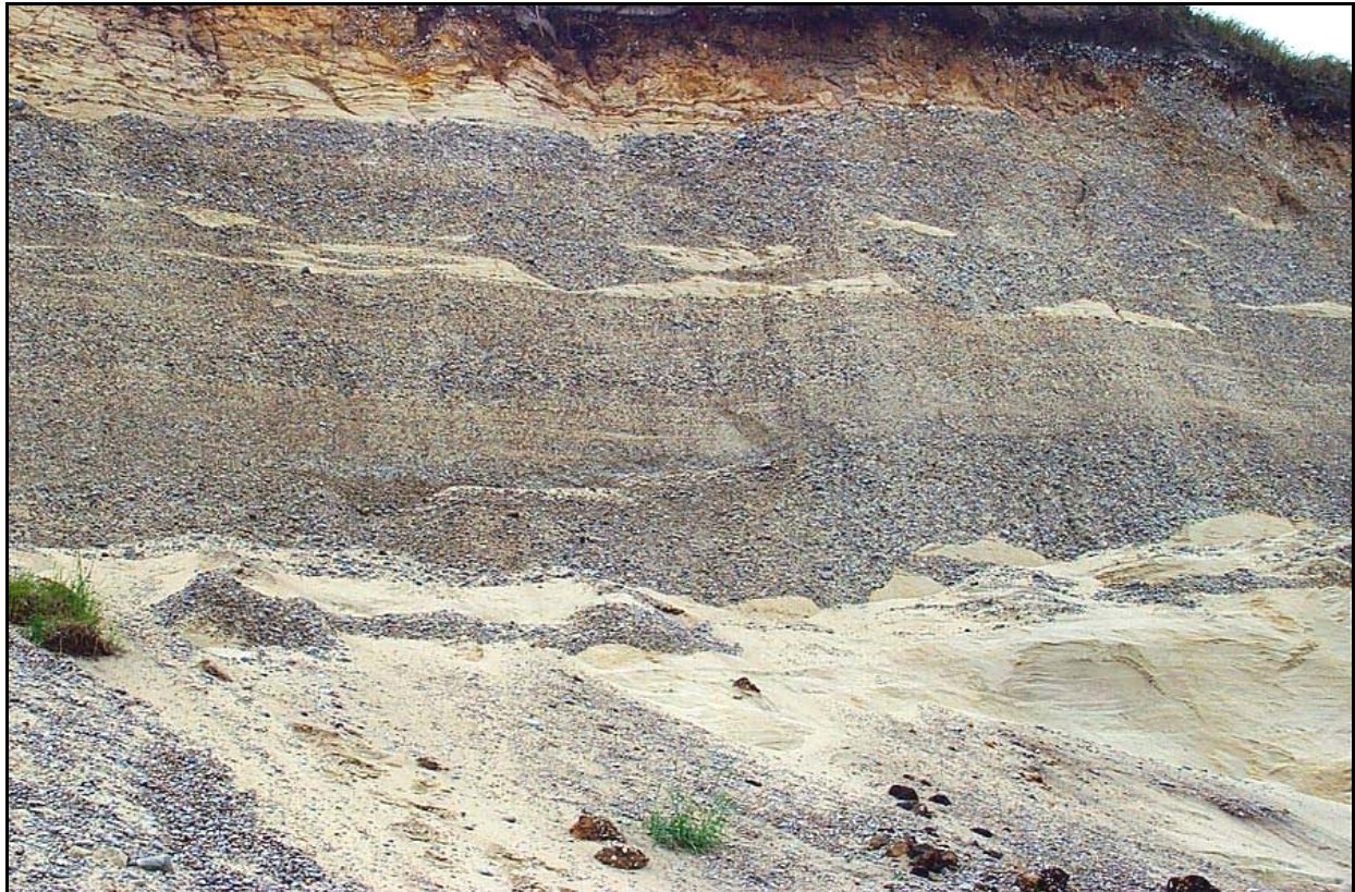
Figure 4 Westleton Beds, north of Sizewell

The Coralline Crag Formation is composed of a series of shelly calcarenites and shelly sands and has been worked both for building stone and as coarse aggregate for trackway and footpath repairs.