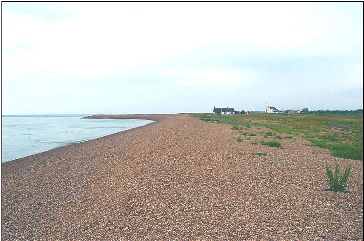
Figure 3 Beach shingle, Orford Ness

Included in this category are deposits marked on BGS maps as 'Shoreface and Beach Deposits', 'Storm Beach Deposits' and a variety of raised beach deposits. Typically these occur as accumulations of sand and gravel restricted to the modern coast and a relatively narrow belt of country adjacent to it. Typically the shingle is composed of 10 to 15 mm diameter clasts of well-rounded flint with subordinate quartz and quartzite, with a matrix of medium grained sand. The most extensive deposits of this type are found to the south of Aldeburgh, at Orford Ness.