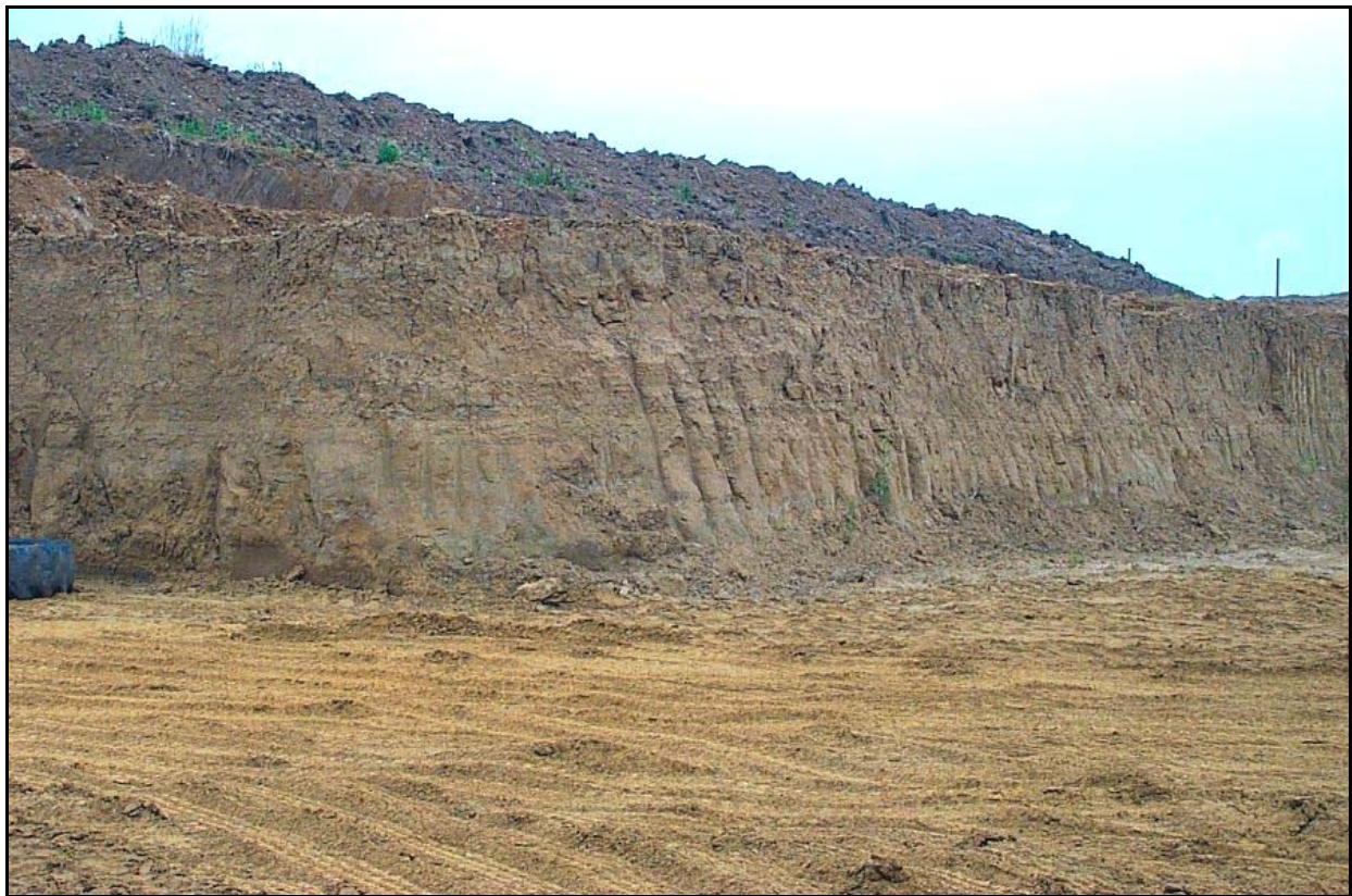
Figure 5 Chillesford Clay and Sand, Hill Farm, near Aldeburgh

Although the outcrop of Tertiary age London Clay is extensive in the south-east of the county, this clay is not shown as a resource since it is generally unsuitable for use in modern brickmaking processes. This is due the presence of relatively high levels of the clay mineral montmorillonite.