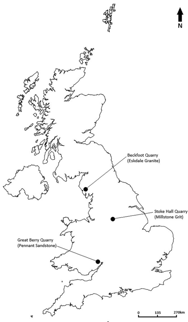
Figure 1 Locations of the rock samples: Millstone Grit, Stoke Hall Quarry, Peak District (Derbyshire); Pennant Sandstone, Great Berry Quarry, Forest of Dean (Gloucestershire); and Eskdale granite, Beckfoot Quarry, Lake District (Cumbria).

62–65; Watts 2014, 29–30). Some of these rocks, such as gabbro and basalt, will give low whole-rock ^{87}\text{Sr}/^{86}\text{Sr} typically between 0.704 and 0.708, whereas granites and schists can give very high whole-rock ^{87}\text{Sr}/^{86}\text{Sr} values, sometimes > 1.0 (Faure and Powell 1972; Peterman and Hildreth 1978; Rundle 1979; Faure 1986). Granites and gabbros (including their finer crystal grained equivalents such as rhyolites and basalts) represent the extremes of isotope composition, but they were not commonly used in Britain, with the possible exception of the imported Mayen Lava from Germany. Instead, the native abrasive sandstones and gritstones were particularly prized and, hence, more commonly used across all periods in Britain (Peacock 2013, 2–3, 62–65,