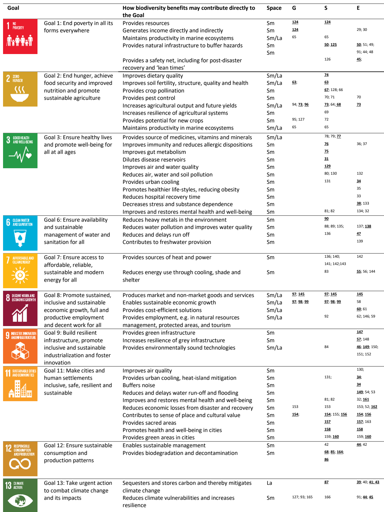
Table 1. How biodiversity benefits may contribute directly to SDGs. References cited provide examples in relation to biodiversity components: genes (G), species (S) and ecosystems (E). Review/synthesis papers are cited in bold and underlined. Spatial scale (Space): small = local to sub-national (Sm); large = national to global (La). Credit: United Nations (UN/SDG).