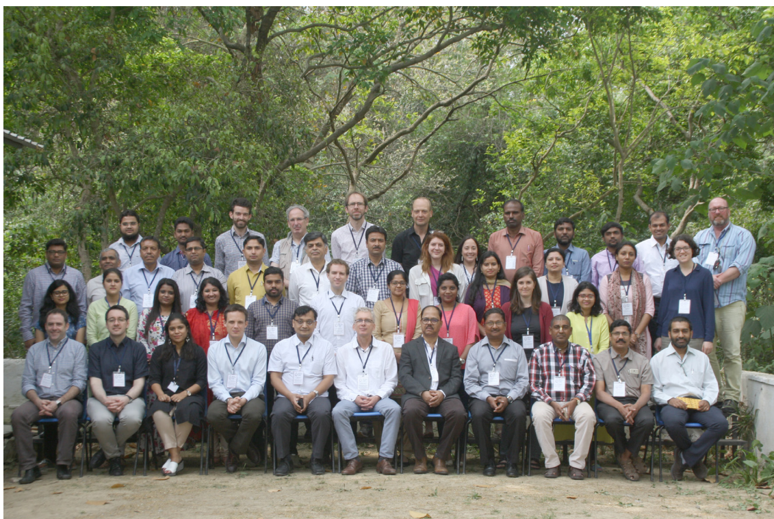
Figure 1: The workshop delegates at the Wildlife Institute in Dehradun

The report is intended for the workshop participants, IUKWC Open Network members and stakeholders.