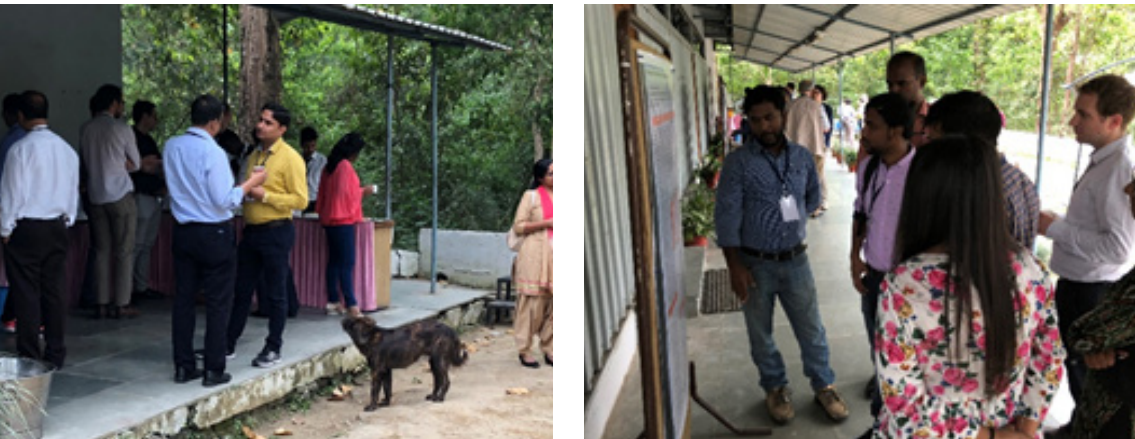
Figure 3: Discussions during the break and at the poster sessions