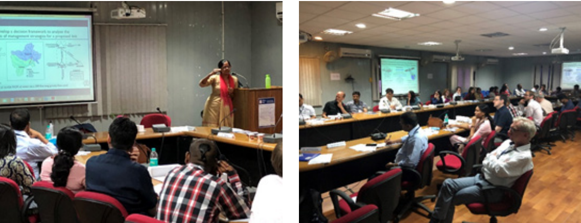
Figure 2: Technical sessions in progress