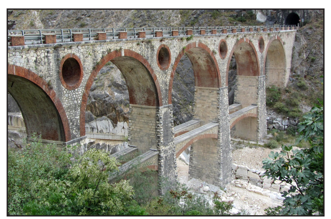
Figure 9. Ponti di Vara, one of the viaducts on the former Marmifera marble railway.

One of the largest single blocks of marble ever extracted and moved came from Carrara. In 1926, Mussolini ordered a huge obelisk for the Stadio Olimpico, and a 300-tonne, 17-metre-long block of bianco white marble was cut from Fantiscritti and moved on a 50-tonne sledge to the port. Il monolitico still stands in Rome.