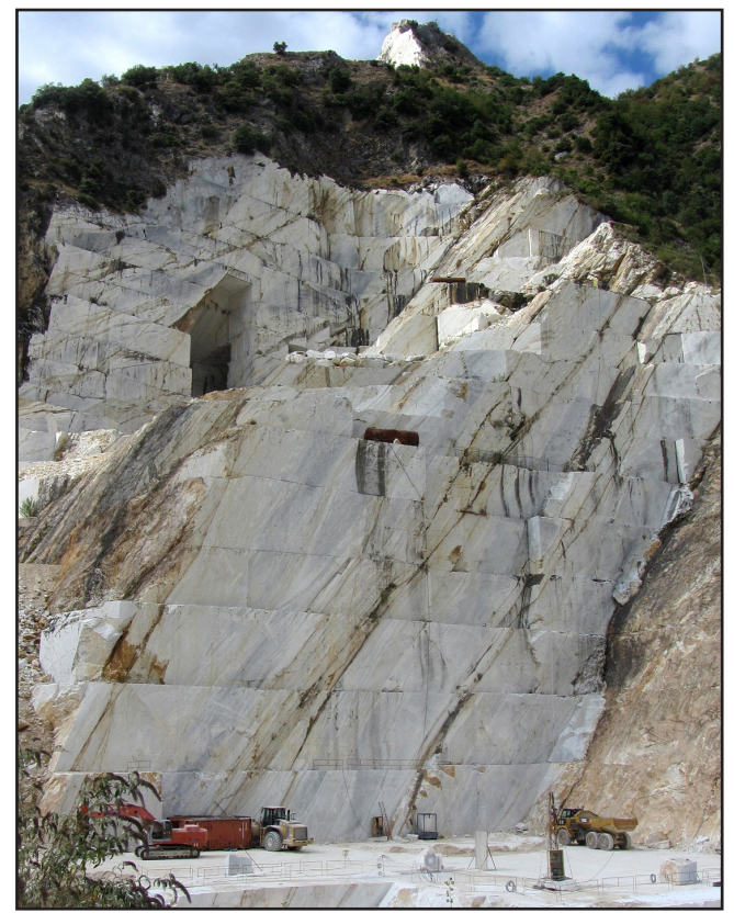
Figure 5. High wall of the Crestola quarry, with steeply dipping bedding features crossed by the working benches.

Unlike the Greeks, the Romans tended to build with cheap local materials and then clad in marble, but using solid marble for columns and pediments, as well as for carved statues. However, they brought in many Greek techniques for working, handling and transporting the stone, and ingeniously developed cables, cranes, ramps, wedges, levers and other devices. However, these still relied entirely on power from man and beast, along with basic physics (freezing of water, floating of rafts, wind, fire and gravity), and these methods were only incrementally refined through the centuries until the 1800s. The improvement of steel tools was particularly important, as was rope technology.