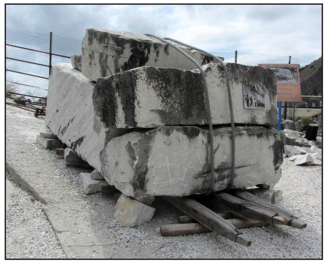
Figure 6. Re-creation of the sledge transport (lizzatura) in the Marble Museum at Fantiscritti.

Given that the underlying strata were an apparently inexhaustible mass of almost pure marble, the precipitous slopes of the Carrara basins offered considerable advantages in that the rock was largely exposed at the surface and could be inspected for quality and ease of winning by the quarrymen (cavatori). Hence many of the quarries (cave, or singular cava, whether open pits or underground mines) were, and are, worked into the hillsides rather than excavated downwards, and are nowadays worked in sequential benches (Fig. 5). Quarrying in Italian Renaissance times (14th to 17th Centuries) required roped climbers (tecchiaioli) to laboriously chisel round and prise out selected blocks of marble, and ease them down onto wooden runners on beds of rubble. Then the sled men (lizzaturi) and cable men (mollatori) would control their further descent (Fig. 6) on slopes of up to 60° down to the working area (poggio). The perilous lizzatura method is celebrated by re-enactment in Carrara every August.