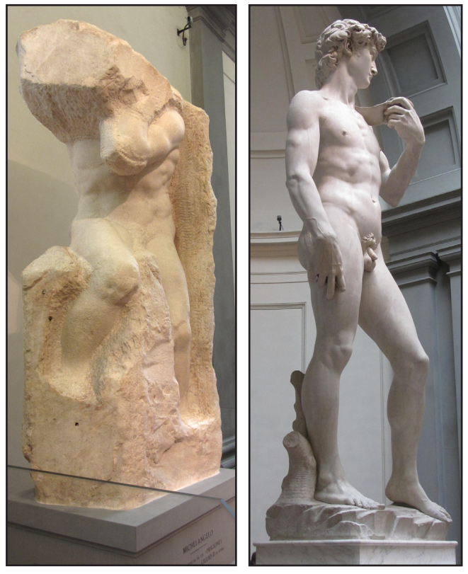
Figure 12 [left]. The incomplete Atlas Captive, 2.82 m tall, carved by Michelangelo 1520-30, and now in the Galleria dell'Accademia in Florence. Figure 13 [right]. The well-known statue of David, 5.17 m tall, carved in Carrara marble by Michelangelo between 1501 and 1504, now in the Galleria dell'Accademia in Florence.

weight, an extraordinary mass to convey by lizzatura . This would have been roughed out to its intended design at the poggio , perhaps into a coffin-shape, but is likely still to have weighed more than 25 tonnes. Carriage to Florence proved problematical, and by the time it arrived in December 1466, Agostino had lost the commission, possibly relinquished on the death of Donatello. The block, now known as il gigante (the giant), was further roughed out and 'spoiled' in 1476–7 by Rossellino, and then sat for 25 years being cotto ('cooked' by the weather) in the Duomo yard, waiting for its genius.