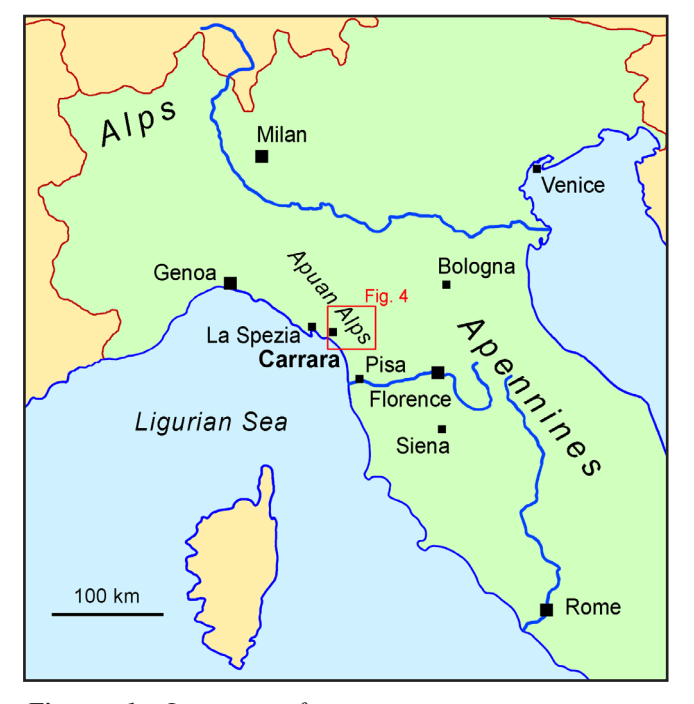
Figure 1. Location of Carrara in northern Italy.

The most famous decorative stone in the world: what other stone might contest this claim? Larvikite clads banks around the world, and there are some spectacular granites used on counter tops, but only marble has been favoured for so many decorative uses. It is worked for many external and internal architecture structures and features, as monuments and gravestones, as household ornaments and objects, and into the finest statuary. The exceptional fame of the perfect, white marble of Carrara stems from an ideal combination of geology, location, topography, history and human physical endeavour, leading to its great output over the millennia, providing material for some of man's finest artistic and architectural achievements.