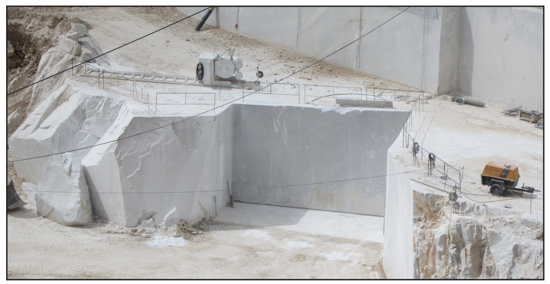
Figure 7. A recent image of a bench currently being worked in the Crestola quarry, with faces that have been cut by crawlermounted chain-saws.