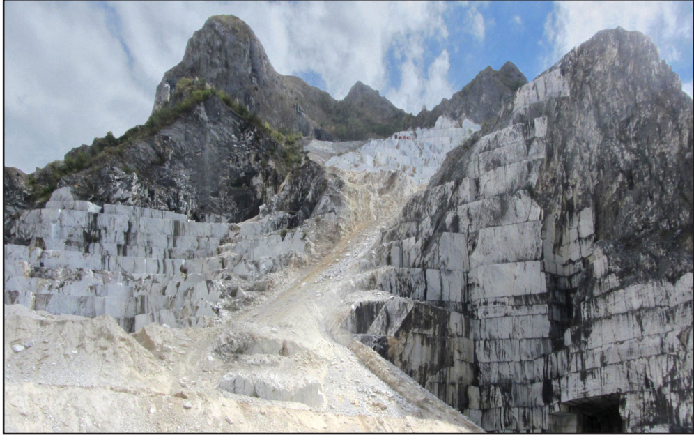
Figure 3. Marble quarries in the Torano Basin, with rubble screes (ravaneti) from the higher one. The Polvaccio Quarry, to the right, was favoured by Michelangelo for his statue marble.

In the Mediterranean region, the use of marble for building and statuary began in classical Greece nearly 3000 years ago, using coarse-grained, grey-blue marble from Naxos (which is still being worked today). The white marble used to build the Acropolis of Athens from the 5th Century BC is from the quarries on Mount Pentelicus, 18 km northeast of the city, but the finest Greek statuary marble, rivalling Carrara, is from Paros, and this was the source for the Venus de Milo.