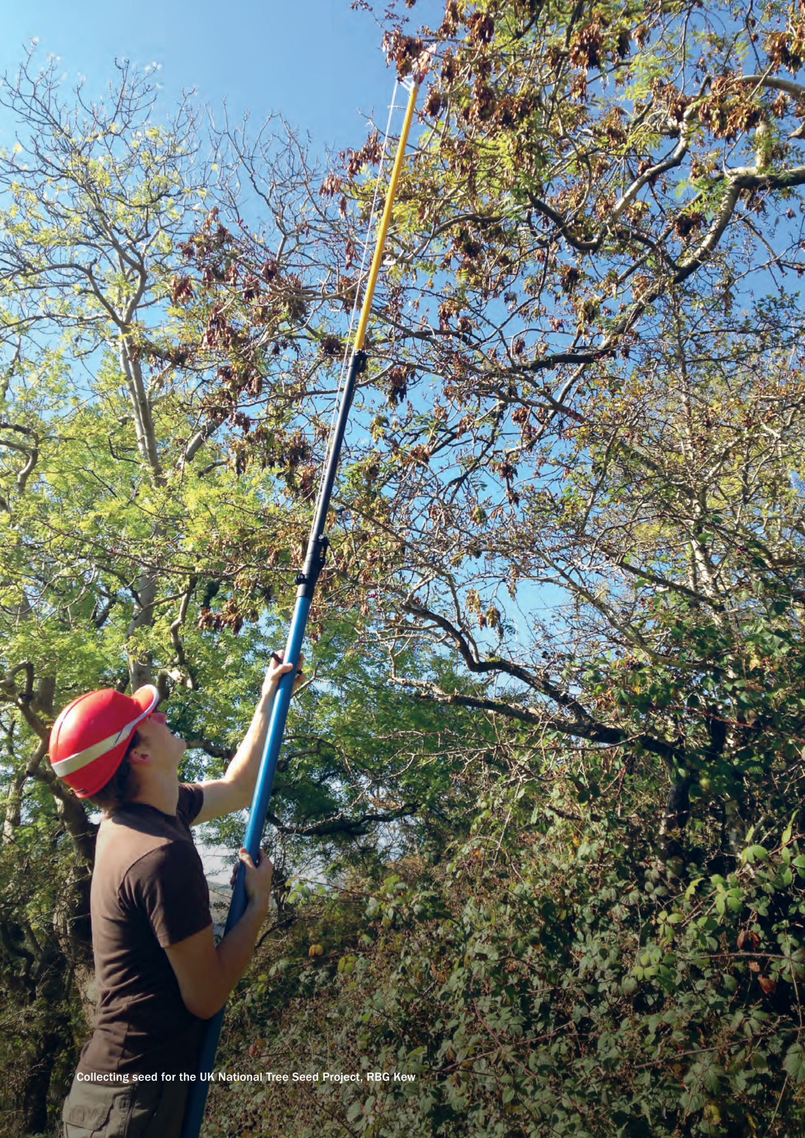
Collecting seed for the UK National Tree Seed Project, RBC Kew