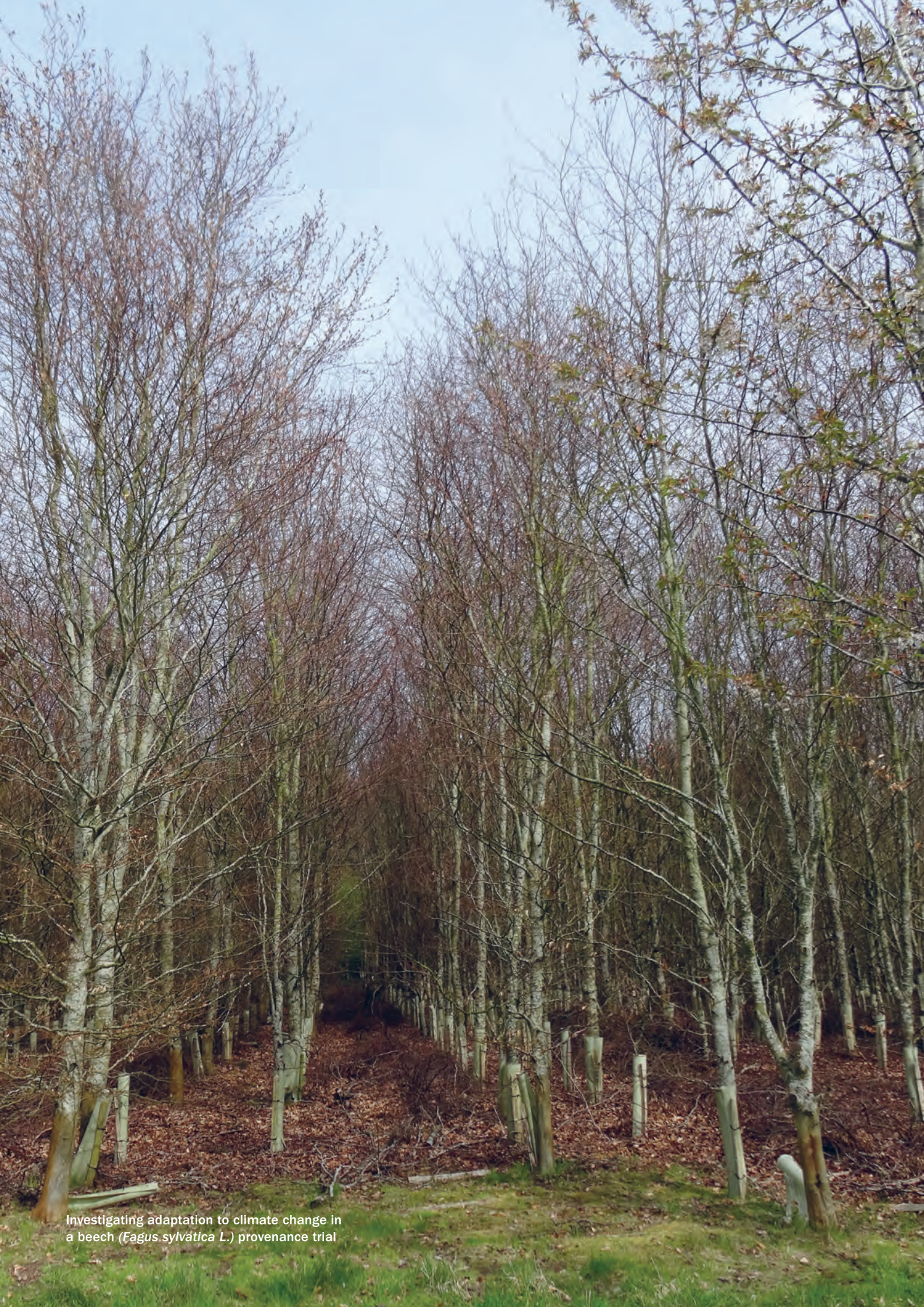
Investigating adaptation to climate change in a beech ( Fagus sylvatica L.) provenance trial