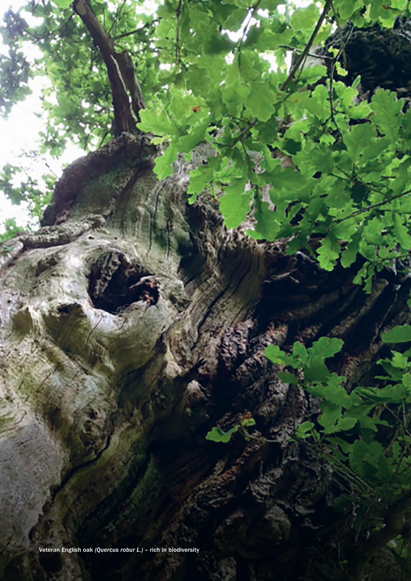
Veteran English oak ( Quercus robur L. ) – rich in biodiversity