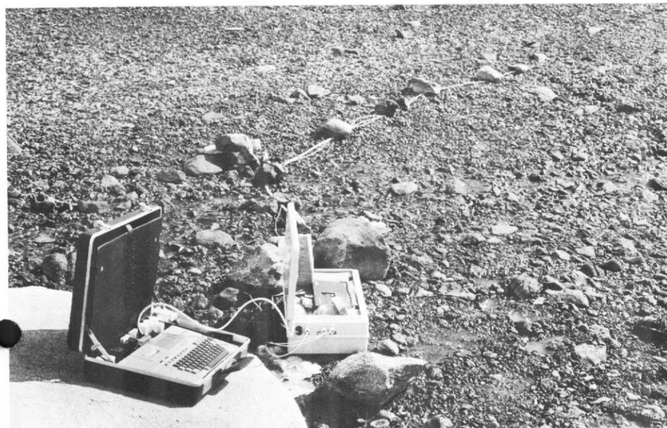
Fig. 1. Microclimate data logger (Grant Squirrel) located in a fellfield study area at Cape Bird, Ross Island. The Epson HX-20 microcomputer (in black case) is interfaced with the logger for data transmission.