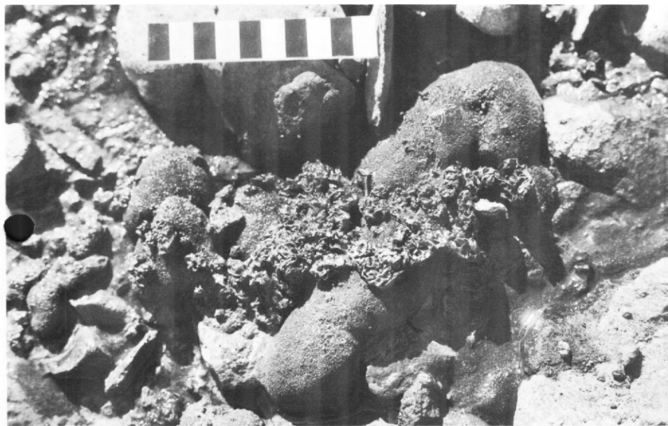
Fig. 3. A clump of the moss Bryum antarcticum with associated algae ( Phormidium spp.) forming a typical streamside community on Ross Island, Antarctica. The scale is in centimetres.