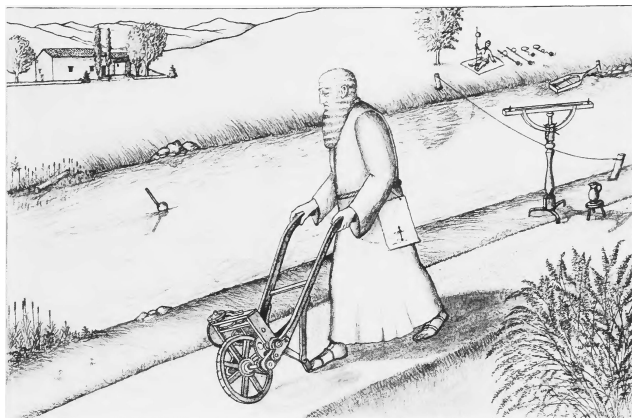
Figure 1. Leonardo da Vinci conducting experiments on the velocity-distribution in streams.