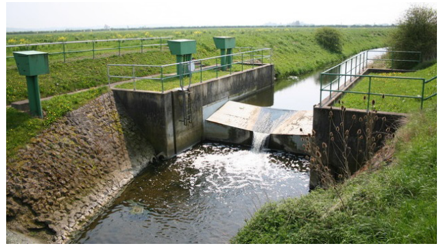
Figure 3. Brant Broughton gauging station, UK.

Another major development in the period 1971–1981 was the reorganization of the scientific structure of IAHS. This had to be enhanced because of the considerable progress that had been made in the analysis of hydrological processes. Before that, many basic questions could only be answered by applying semi-empirical approaches. Better understanding and a more sophisticated and a higher conceptual level were reached by the application of system analyses, stochastic methods and analysis of time series. These techniques of applied mathematics had been developed at least two decades earlier, but it took a long time before they became part of hydrological practice. The term “parametric hydrology” came into being. A “Committee on Mathematical Models” was set up, which later received the status of “Commission on Water Resources Relations and Systems”. The title indicates that