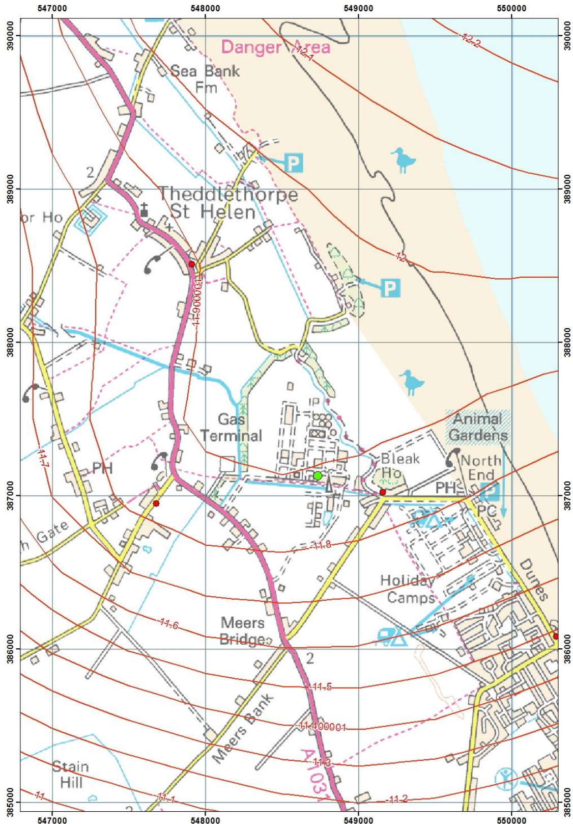
Figure 5: Regional Bouguer gravity anomaly field for the Viking Gas Terminal, Theddlethorpe St Helen and surrounding area with 0.1mGal contours, in red. Regional gravity stations shown as red points, position of the gravity measurement shown as a green point.

Based on 1:50,000 scale Ordnance Survey Maps. © Crown Copyright and database rights 2014. Ordnance Survey Licence No. 100021290.