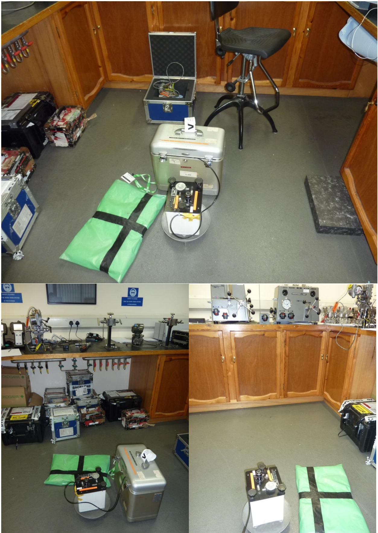
Figure 3: Photographs showing the position of gravity measurement on the floor of the Metering Calibration Laboratory, Viking Gas Terminal. The measurement point is under the meter: at the midpoint between the two deadweight tester benches (to the left and right), and 1.70m from the back wall.