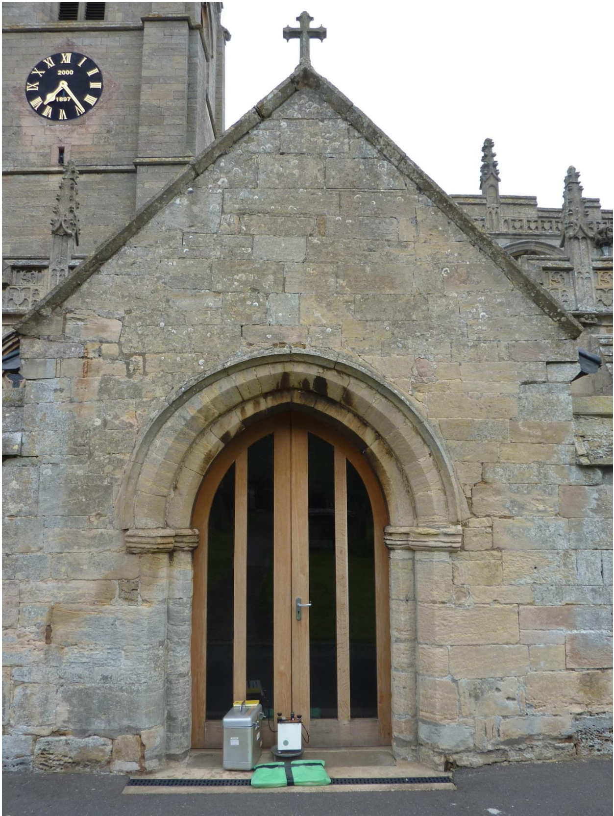
Figure 2: Photograph showing the position of gravity measurement at St Sebastian's Church, Great Gonerby BPGN93 Gravity station.