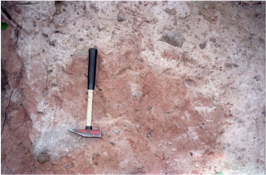
Figure 45. Exposure in the diamict underlying the asymmetric transverse ridge at Easterton (hammer 35 cm).

has been visible for almost 20 years. The highly weathered face shows up to 2.1 m of very sandy diamict with a distinctive mottled and ‘churned’ appearance. The matrix of the diamict ranges in colour from pinkish grey to moderate reddish orange (Fig. 45) The clasts within diamict are mainly subangular pebbles of metasandstone and pale orange sandstone; some angular blocks of semipelitic gneiss, brown sandstone and quartzite, up to 40 cm in diameter, are also present.