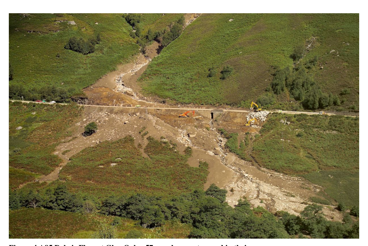
Figure 4 A85 Debris Flow at Glen Ogle. 57 people were trapped in their cars