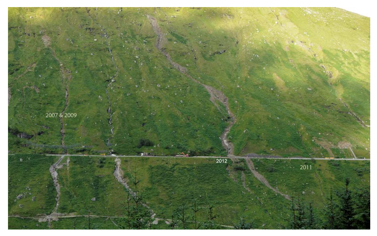
Figure 7 Recent debris flows on the A83 Rest and Be Thankful Pass