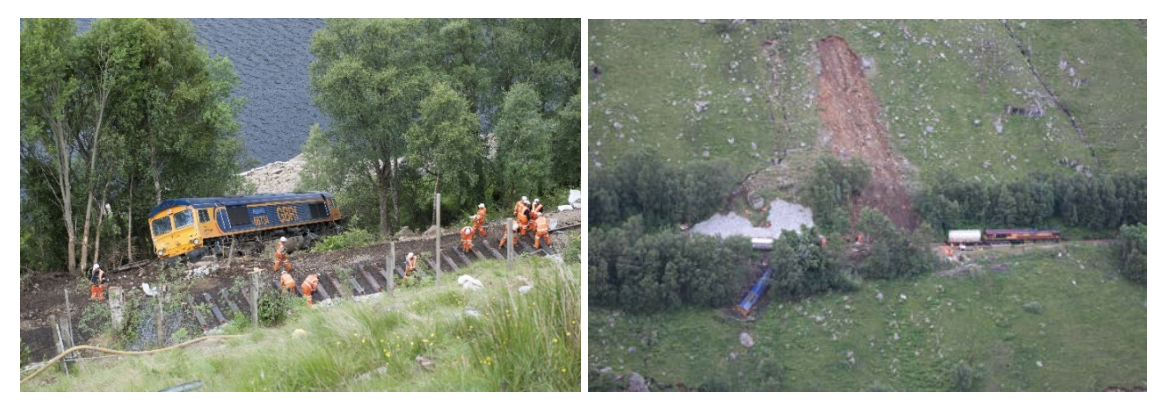
Figure 5 Stob Coire Sgriodain by Loch Treig, in the Scottish Highlands where a train was derailed.