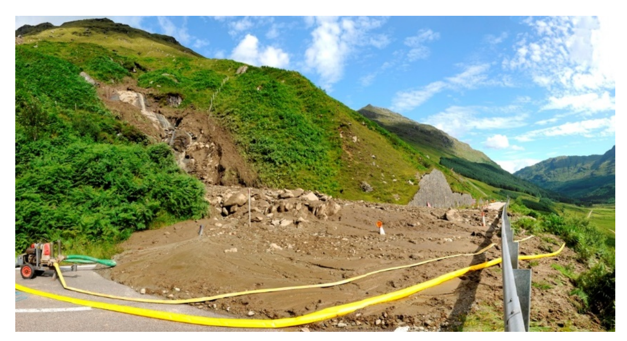
Figure 6 Debris flow deposit blocking the A83 Rest and Be Thankful, August 2012