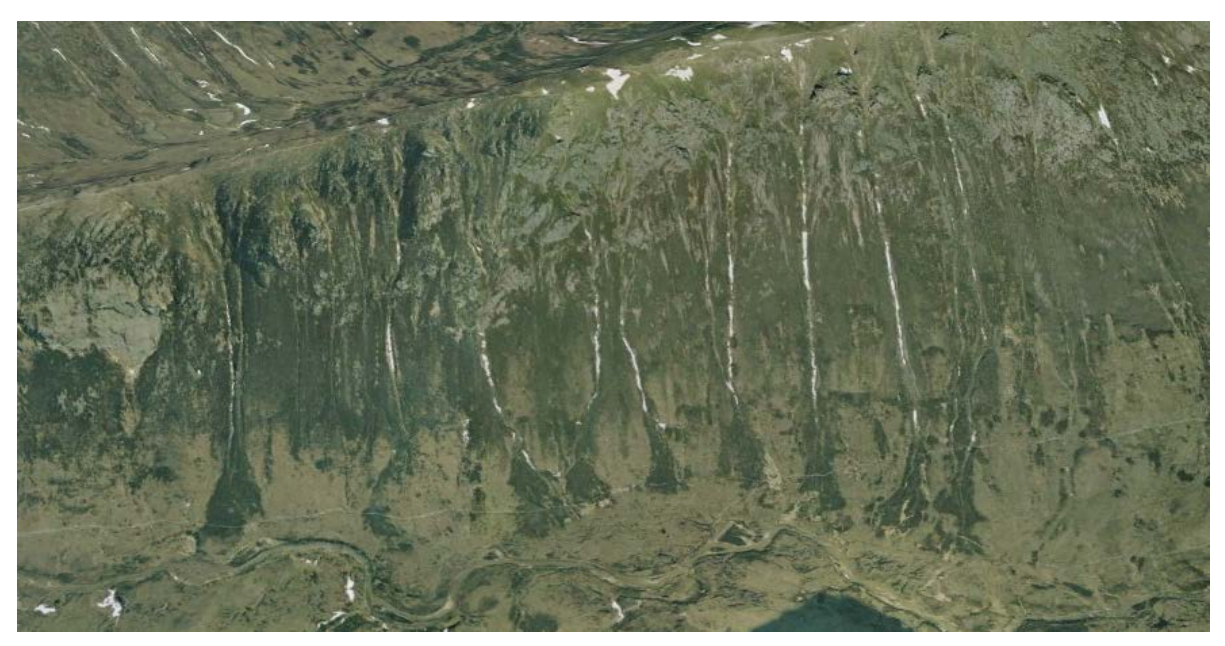
Figure 1 Examples of debris flows in Lairig Ghru, Cairngorms, Scotland.

The term debris flow refers to the rapid downslope flow of poorly-sorted debris mixed with water (Ballantyne, 2004). Debris flows are described by Hungr et al. (2014) as: "very rapid to extremely rapid surging flow of saturated debris in a steep channel. Strong entrainment of material and water from the flow path". They are a widespread phenomenon in mountainous terrain and are distinct from other types of landslides as they can occur periodically on established paths, usually gullies and first- or second-order drainage channels. Debris flows in Great Britain are most commonly found in upland Scotland but also in parts of Wales and the Lake District (e.g. Figure 1).