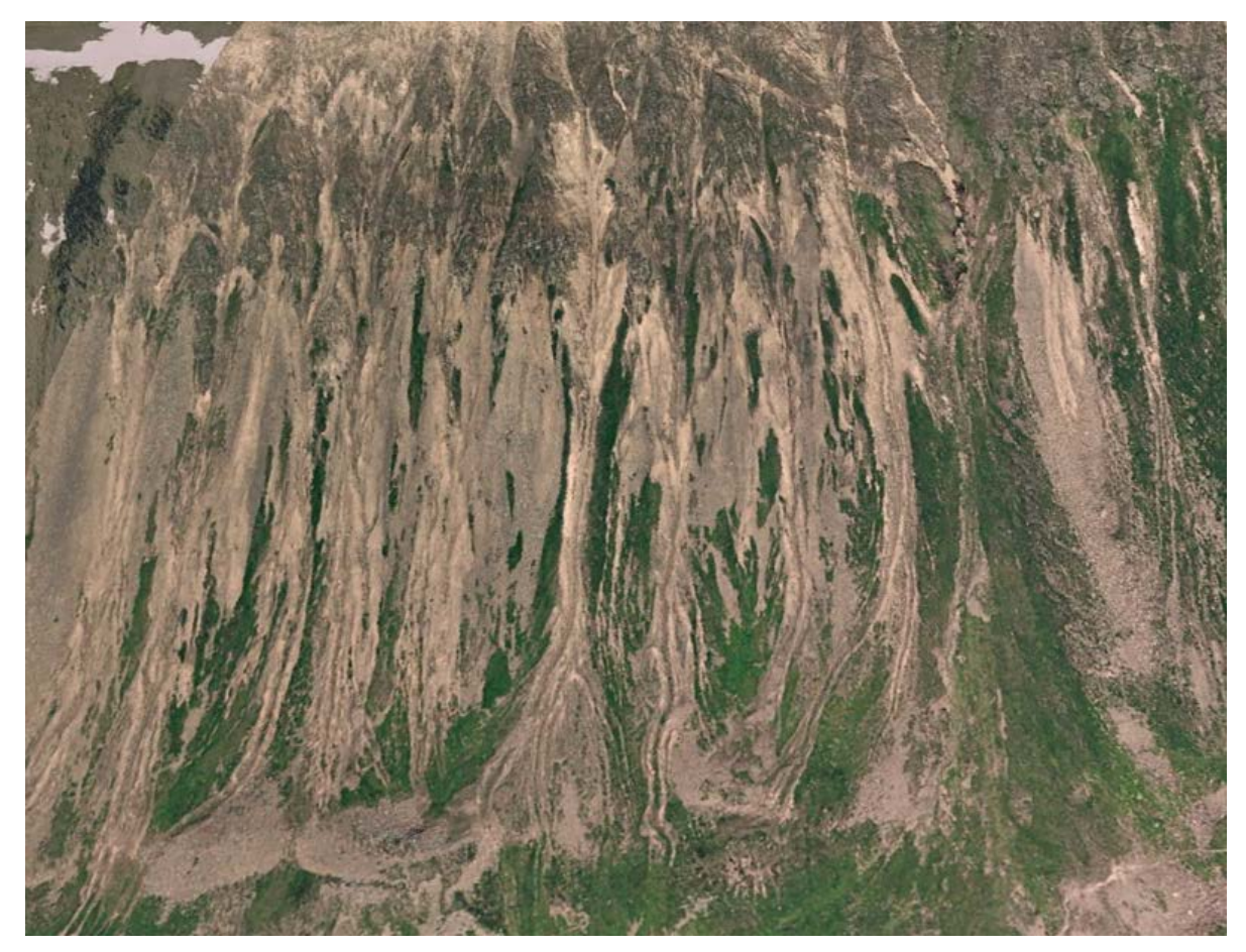
Figure 3 Debris flows in Lairig Grhu, Cairngorms, Scotland showing levée features.

Debris flows consist of three main parts: a source area, track and depositional area.