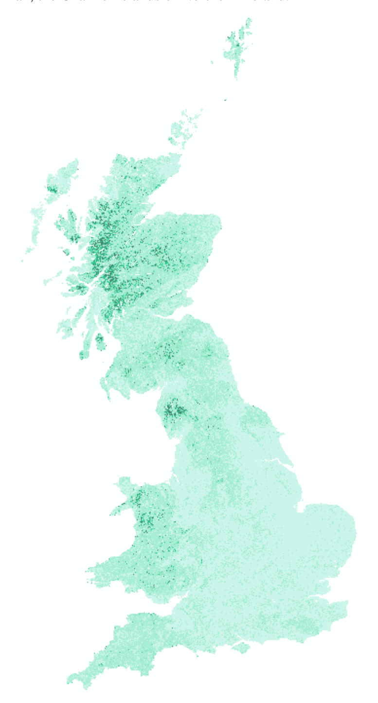
Figure 8 Extent of coverage of the Debris Flow Susceptibility Model. Contains Ordnance Survey data \odot Crown Copyright and database rights 2017

The Debris Flow Susceptibility Model covers Great Britain (Figure 8). This does not include the Isle of Man, the Channel Islands or Northern Ireland.