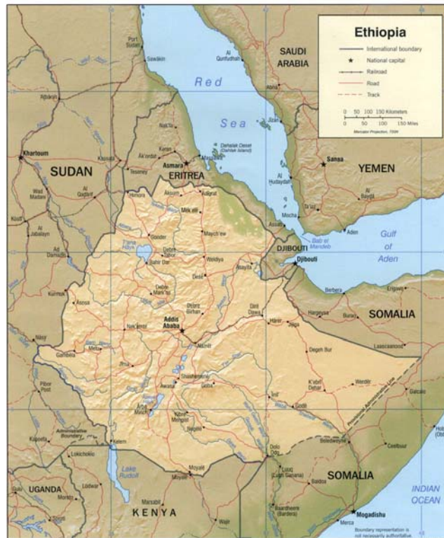
Figure 1. Location map of Ethiopia (courtesy of the General Libraries, University of Texas at Austin).

The lowlands of south-eastern Ethiopia (east of Goba, Figure 1) as well as parts of the north are composed of sedimentary rocks of various ages. Many occupy low-lying depressions (e.g. the Danakil Depression) which are the result of the many tectonic movements associated with rifting. The sediments are largely mixed deposits of sandstone, limestone and silt, but contain frequent occurrences of evaporite minerals, including halite (rock salt), gypsum (a calcium-sulphate mineral) and potassium- and magnesium-salts. Major reserves of rock salt, possibly on an economic scale, exist for example in the Danakil Depression.