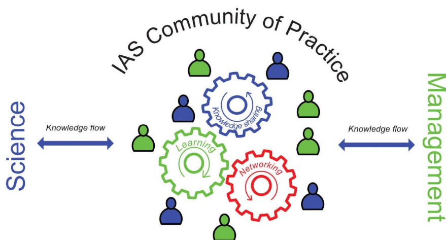
Figure 1. Knowledge flows among IAS Community of Practice, Science and Management.

“risk analysis” refers to: (1) the assessment of the consequences of the introduction and of the likelihood of establishment of an alien species using science-based information (i.e., risk assessment), and (2) the identification of measures that can be implemented to reduce or manage these risks (i.e., risk management), taking into account socio-economic and cultural considerations.