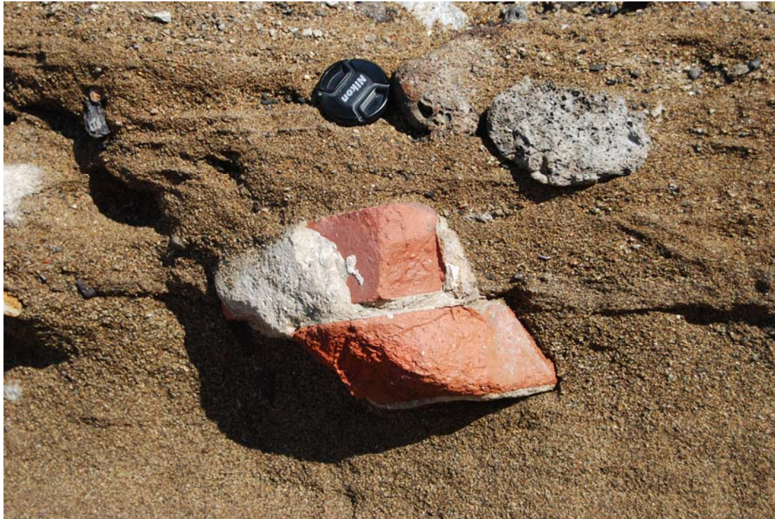
Fig. 1. Bricks and concrete fragments in carbonate-cemented beach rock deposits on the Tunelboca geosite, Basque region, Spain.

would allow full consideration as ‘urban strata’, to be contrasted with ‘natural’ geological strata (Fig. 1). Archaeologists, though, excavate and record urban layers as distinct from underlying geological strata (Carver 1987), compiling large datasets relevant to this process.