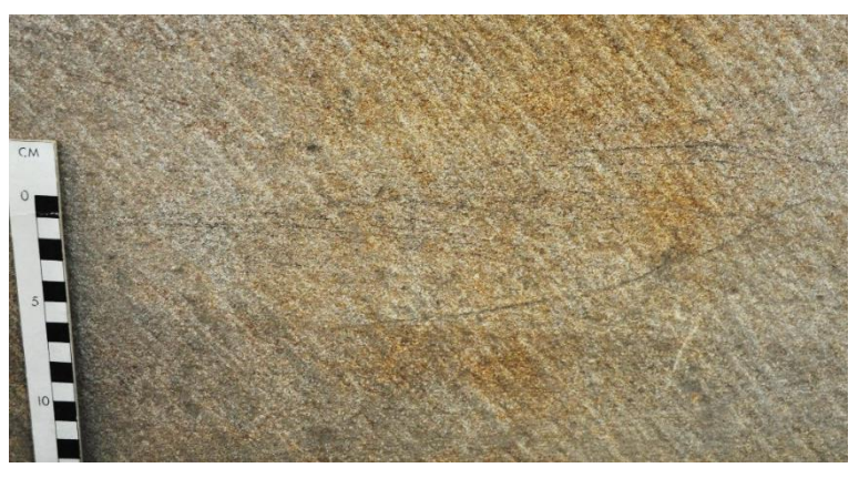
Figure 5 Faintly visible laminae (thin, dark grey/brown layers) are developed in gently curved sets (cross-bedding). Each division on the scale bar is 1cm.