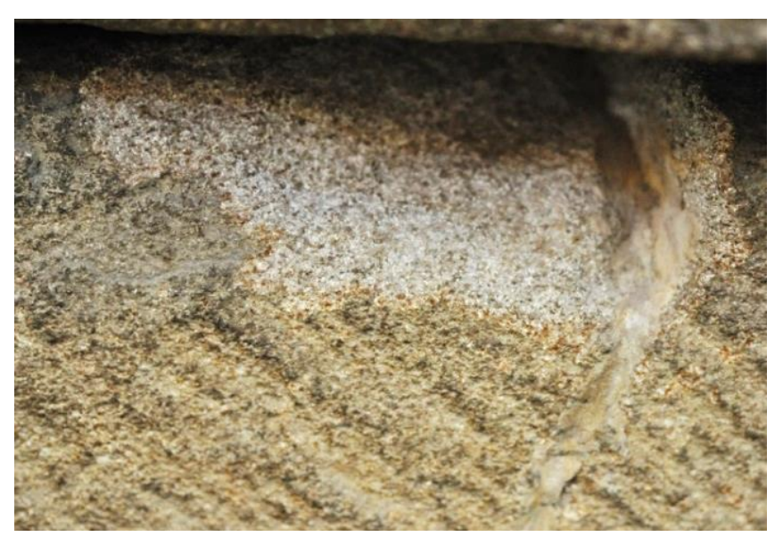
Figure 2 A piece of stone has broken off the base of the sarcophagus above a crack, revealing the light grey colour of the fresh stone

Texturally, the stone is essentially uniform; however, two small, dark grey mud flakes up to 3 cm across were observed (Figure 4), and several dark grey/brown laminae (thin layers <1mm thick consisting of concentrations of iron oxide minerals), which reveal cross-bedding, are faintly visible on one side of the base.