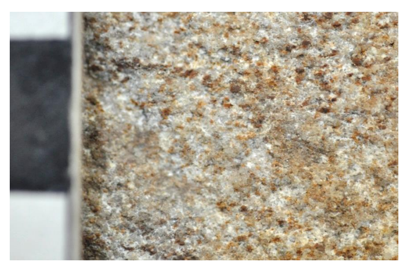
Figure 3 Detail of grain-scale characteristics in the stone. The black division on the scale bar at left is 1cm from top to bottom