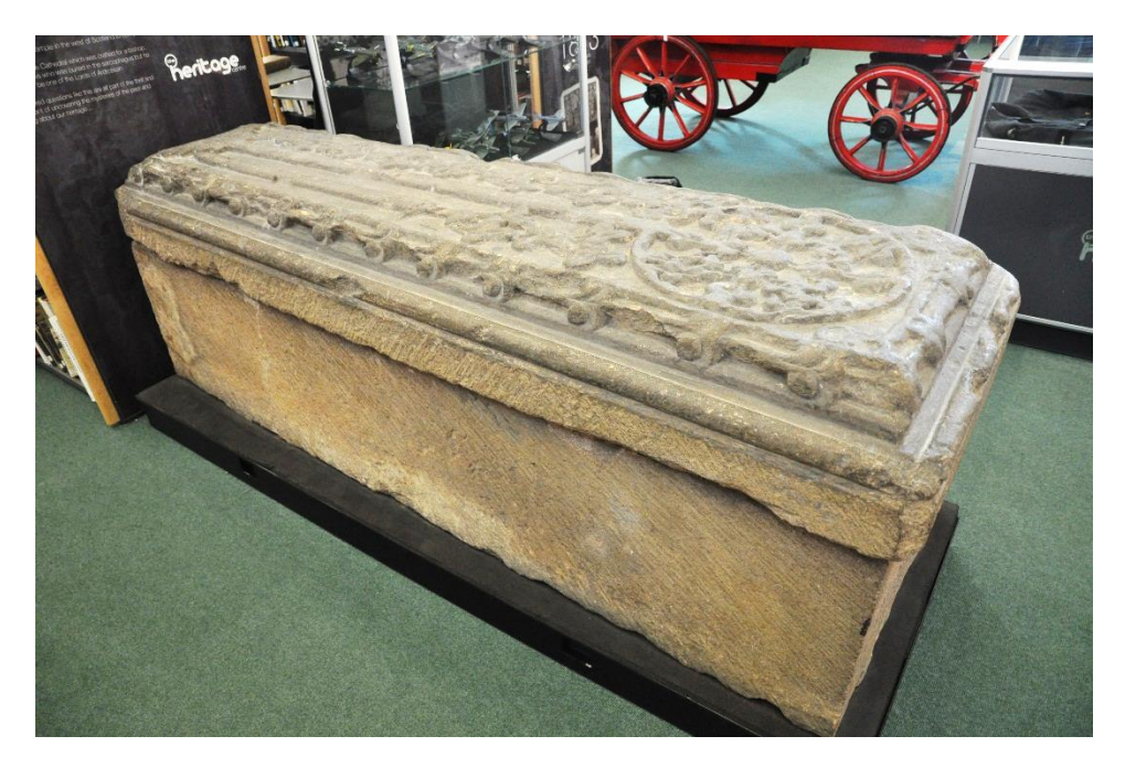
Figure 1 The Ardrossan Sarcophagus

In order to achieve these objectives, Paul Everett (BGS) visited the North Ayrshire Heritage Centre on 23rd June 2016 and conducted a brief visual examination of the sarcophagus.