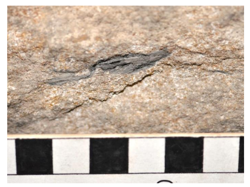
Figure 4 A mud flake in the sandstone. Each division on the scale bar is 1cm