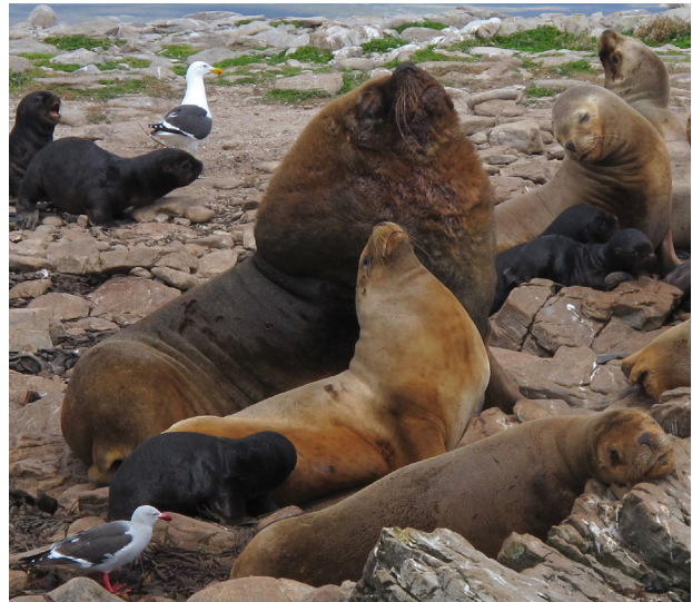
Fig. 1. Southern sea lions show extreme sexual size dimorphism, as illustrated here: an adult male southern sea lion (centre) surrounded by adult female southern sea lions (and pups)

Here, we assess sexual segregation in southern sea lions (SSL) Otaria flavescens breeding at the Falkland Islands (South Atlantic) during early lactation. SSL exhibit sexual dimorphism in body mass, body shape and pelage (Fig. 1). Specifically, adult male SSL weigh twice as much as adult female SSL (>300 kg versus <160 kg, respectively), have comparatively large, broad heads, characteristic blunt, upturned muzzles, and thick manes comprised of long guard hairs extending from their heads to shoulders (Ralls & Mesnick 2008). Life histories also differ. Adult male