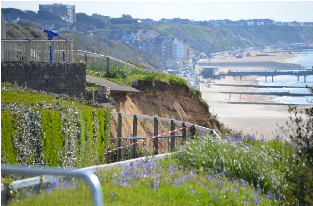
Backscarp of the East Cliff landslide, Bournemouth, 24 April 2016.

The landslide occurred on Sunday 24 April 2016 at approximately 05:00 on a section of East Cliff where it is approximately 35 m high with an overall angle (unslipped) of about 36 degrees.