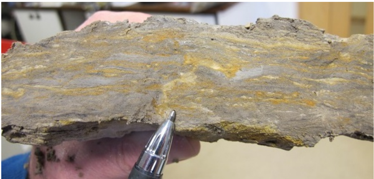
Example of Branksome Sand Formation bedding. Specimen taken from landslide debris. Thinly interbedded/laminated silty sands and silty clays, with a sand-filled drying (?) fissure.

The geology of the cliffs at East Cliff comprise a sequence of generally very weak sandstones and mudstones from the Mid-Eocene, belonging to the Boscombe Sand Formation and the underlying Branksome Sand Formation .