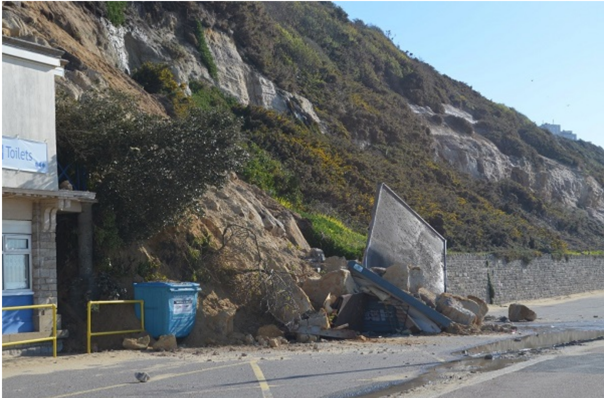
Toe of the landslide at East Cliff, Bournemouth, showing the toilet block, 24 April 2016.

What appeared to be clean water was seen emerging from the destroyed toilet block onto the road. This is assumed to be from a fractured water supply pipe within the toilet block. No water was observed emerging from the landslide itself, although access onto the landslide was not possible and hence the presence (or absence) of water within the landslide could not be confirmed.