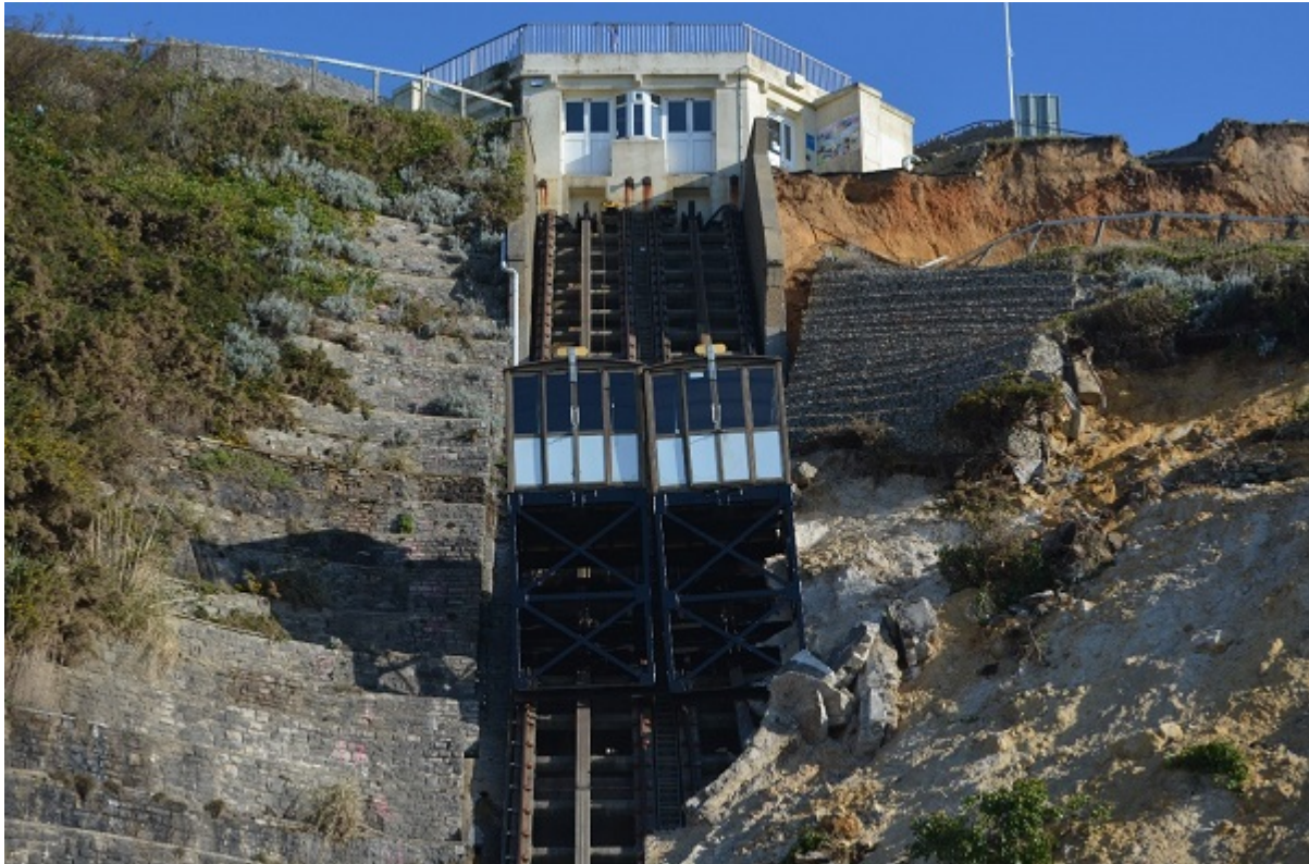
East Cliff lift funicular railway, constructed 1908, after the landslide, Bournemouth, 24 April 2016.

Little revetment masonry from the flanks of the East Cliff lift (constructed 1908) was evident in the landslide, though the eastern flank had dropped several metres leaving the concrete wall exposed. It is therefore possible that the landslide had overridden the bulk of the masonry on the central and lower parts of the slope.