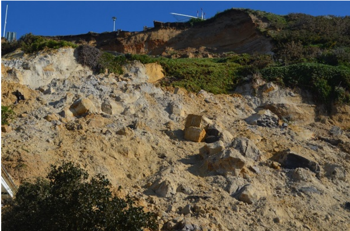
The slip mass of the East Cliff landslide, Bournemouth, 24 April 2016.

The landslide split either side of the café block (which remained intact) forming two masses of material. The slip masses contain several large boulders up to approximately 2 \times 1 \times 1 m. The larger, eastern mass progressed farther downslope than the western due to the destruction of the toilet block. The slip mass as a whole appeared potentially unstable and further movements were considered likely.