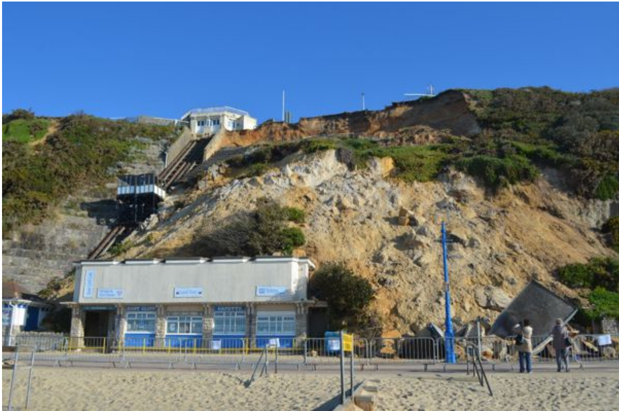
Landslide at East Cliff, Bournemouth, 24 April 2016. East Cliff lift (funicular) on far left, café on left and destroyed toilet on right. Undercliff Drive in foreground.

The Landslide Response Team carried out a walk-over survey of the site on 27 April 2016. Data collected from this survey is logged in the BGS National Landslide Database (NLD 20108/1).