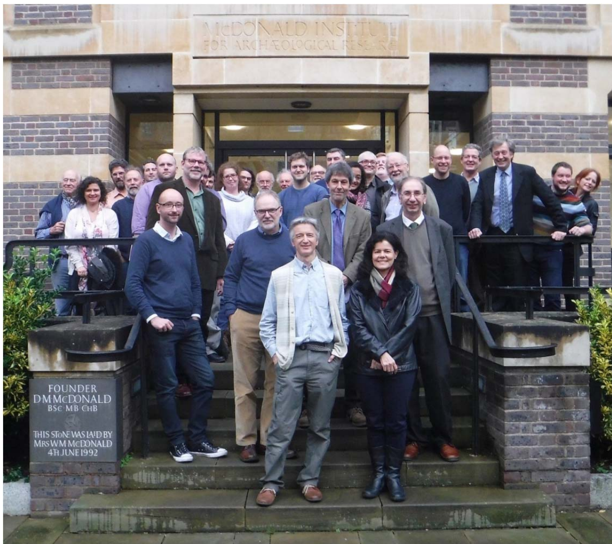
Figure 1. Workshop participants on the steps of the McDonald Institute