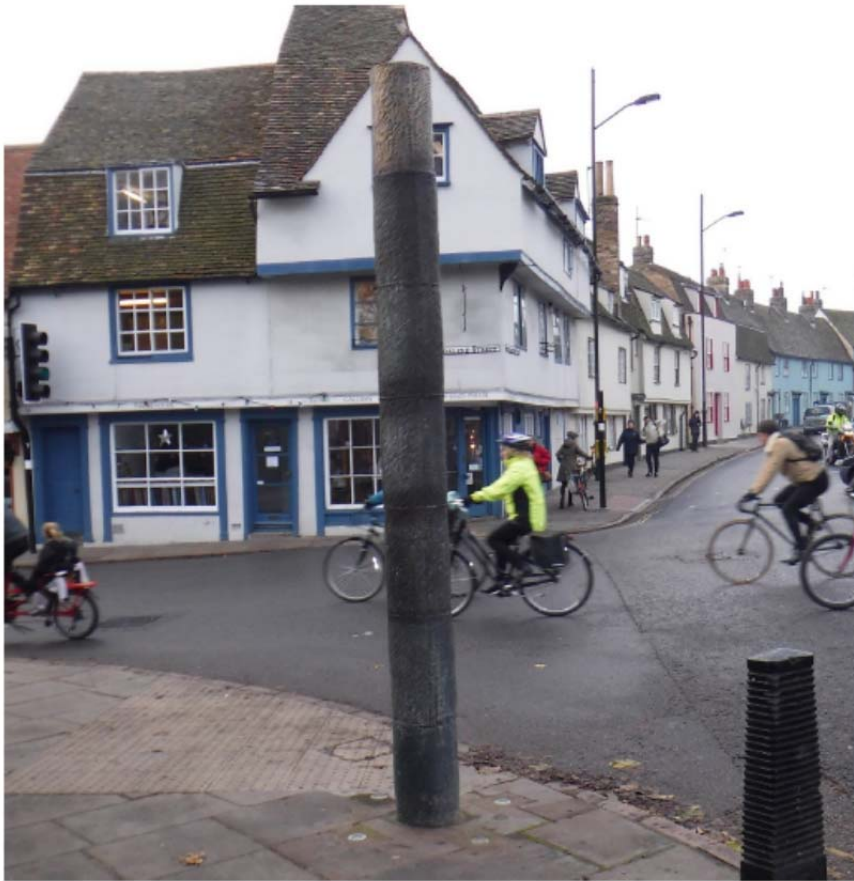
Figure 3. The Core by Michael Fairfax, 2001, a bronze engraved column at Chesterton Corner, Cambridge. The 3.5m high column represents the depth of anthropogenically-modified ground at this point, as revealed and recorded during construction of a sewer shaft.