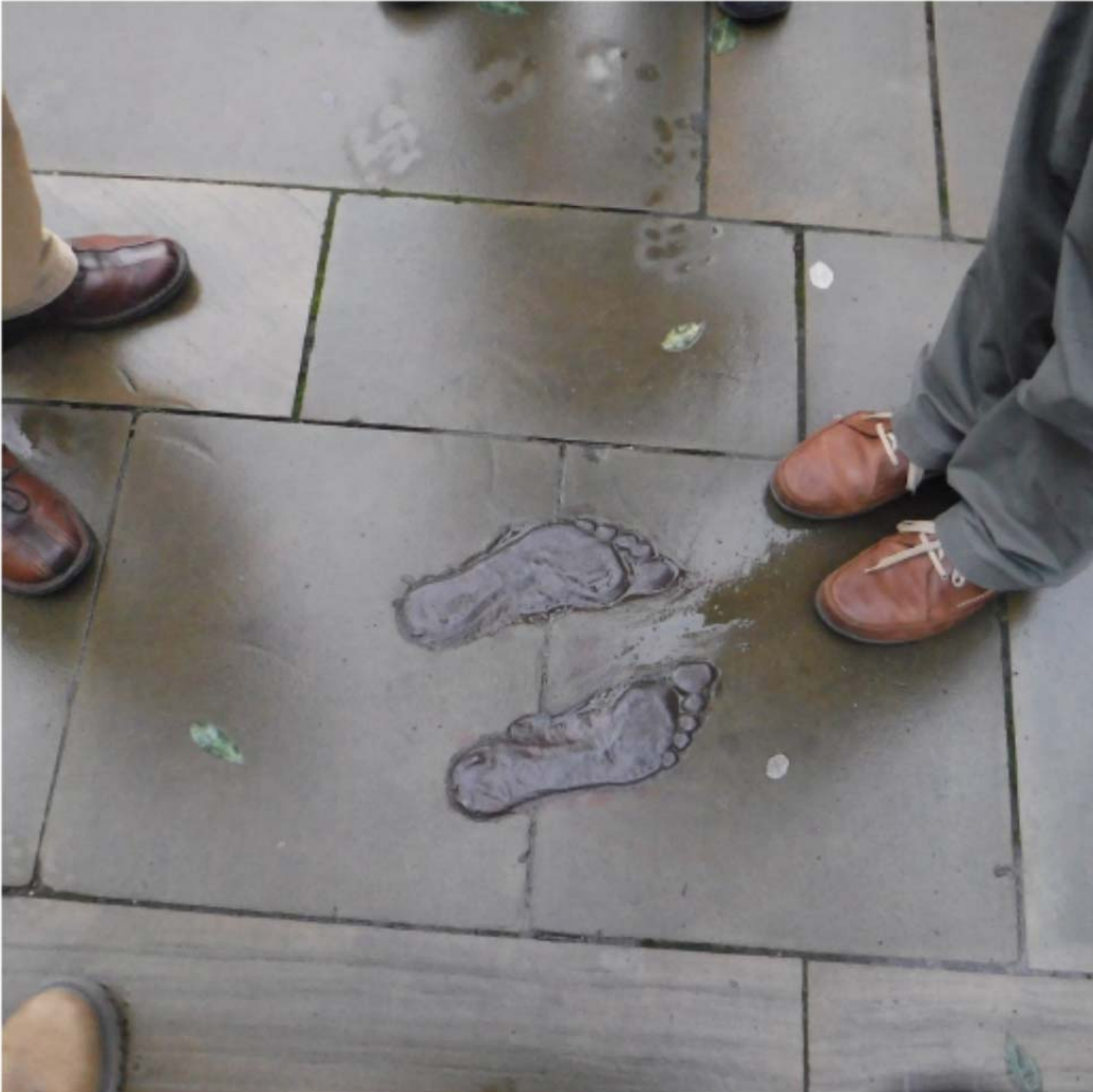
Figure 2. Workshop participants contemplating the sculpture Earthbound Plant by Antony Gormley (2002), outside the McDonald Institute, Cambridge. Easily overlooked, this is a life size cast-iron statue of a human figure buried upside down and entirely encased in anthropogenic strata, with only the soles of the feet showing on the ground surface.