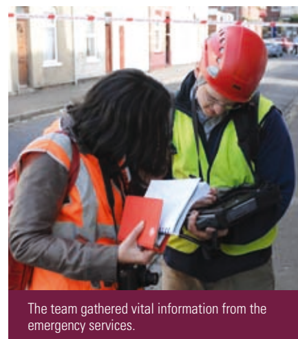
The team gathered vital information from the emergency services.