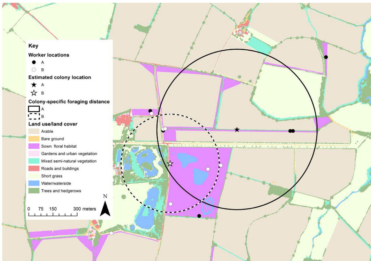
FIG. 1. Example of the colony location estimation method, overlaid on the land use/land cover map, for two bumble bee colonies (A and B). Black/white circular symbols = capture locations of workers determined to be from a given colony following genetic analysis. Stars represent mean centers of these locations, i.e., estimated colony locations. Solid/dashed lines represent buffers with a radius equal to the mean distance of all full sister workers to their estimated respective colony locations (i.e., colony-specific foraging distance).

Mean center locations were “snapped” (i.e., moved to coincide exactly with the coordinates of another feature) to the nearest LULC class that might have formed