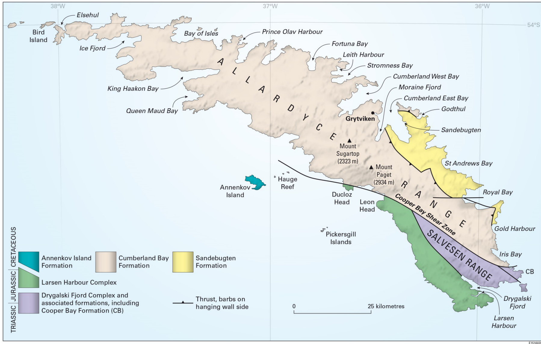
Figure 2. Outline geology of South Georgia (after Curtis and Riley 2011).