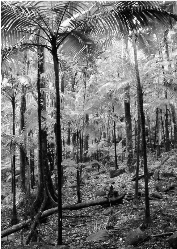
PLATE 1. Luquillo Forest Dynamics Plot, in northeast Puerto Rico, with the common palm Prestoea acuminata in the foreground.

a tradeoff with herbivore defense such that these species are more vulnerable as seedlings. Future research could resolve this question by directly quantifying defense mechanisms and incorporating these into demographic models.