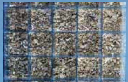
Bioassay container housing individual test larvae infected with the virus, turning them a milky white colour.

conditions. In these experiments, they were able to analyse host and virus population dynamics and transmission routes in a relatively natural set-up. Second, the researchers conducted evolution experiments in small microcosms, in which they had a much higher degree of control over the host-pathogen interaction. This allowed them to study the occurrence and evolution of different transmission strategies, along with the associated pathogen traits, at selected host densities.