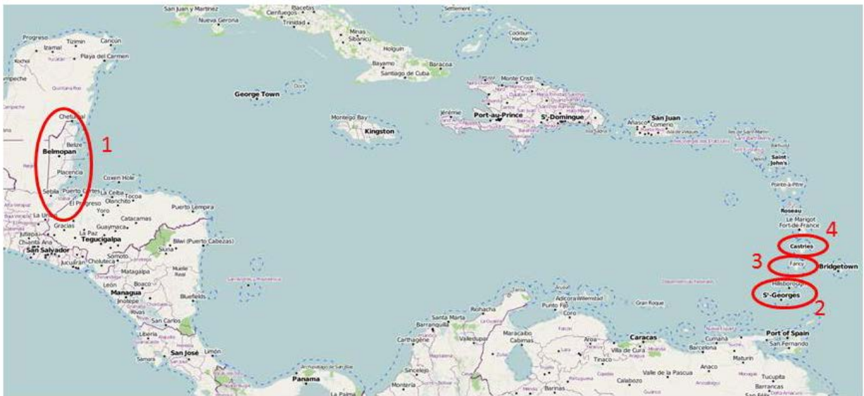
Figure 1 Location of the four target countries for EO-RISC. 1. Belize, 2. Grenada, 3. St Vincent and the Grenadines, 4. St Lucia © OpenStreetMap contributors.

The Caribbean itself is in the path of Atlantic hurricanes bringing extreme weather which, in combination with the terrain and geological conditions, makes them prone to landslides. Furthermore there is a susceptibility to floods, storm surges and tsunamis. The seismic and volcanic activity in the area also poses a hazard. In addition, it was noted in van Westen (2014) that “the small island states in the Caribbean – especially those of volcanic origin with rugged and steep terrain – have limited suitable surface area for development and agricultural production. Most of the population live along the coast....these areas are affected by floods” while “vital infrastructure that traverses the mountainous areas can be severely damaged by landslides...these events have a severe impact on the relatively small economy of these countries”.