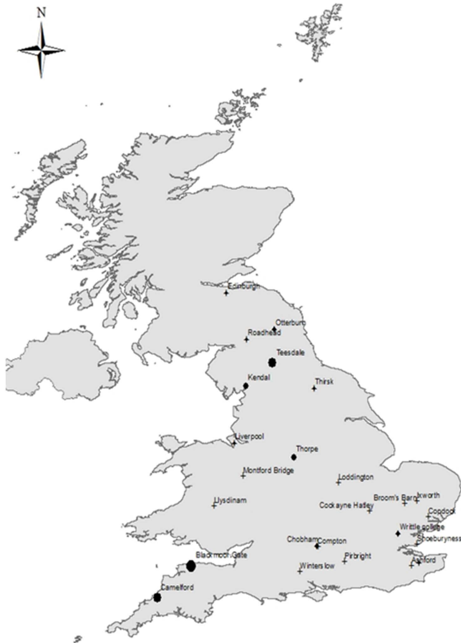
Figure 1. Locations of UK trapping sites for Culicoides surveillance (2006–2010). Circle area is proportional to maximum catch ever recorded per site, where complete yearly data were available. Sites with crosses lacked complete yearly trapping profile. doi:10.1371/journal.pone.0111876.g001

individual species in the Avaritia male dataset. The start of the season for Avaritia females was defined as the first day of the year in which more than five pigmented females were caught (in accordance with the definition used by European Union Council to define the start and end of the SVFP in Europe). Site-by-year combinations were only included in the analysis if at least two trapping nights prior to this date had been recorded. The end of the season for Avaritia females was similarly determined as the last day of the year in which more than five pigmented females were caught (with the site-by-year combination being excluded from analysis if there were less than two subsequent trapping nights