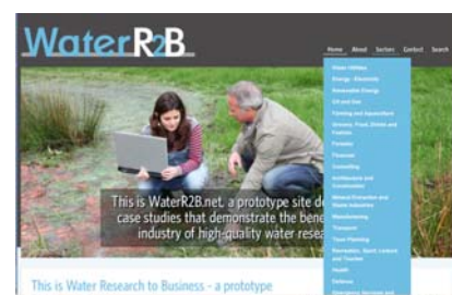
Figure 4 The WaterR2Bhe case studies website

The new PF added an extra task (Task 6.1), into the WP to develop case studies of benefit to industry from NERC and other freshwater science. WSKEP has developed a dynamic website for many different sectors, from the water utilities, through, farming, energy, consulting and health amongst others to highlight case studies of where working with research organisations, industry has solved some of its challenges and needs. The website is called WaterR2B ( http://waterr2b.net/ ) (Figure 4) and was showcased at the RCUK Water