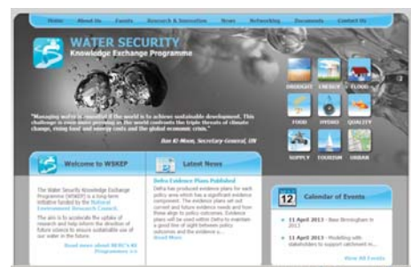
Figure 3 The WSKEP Web site

The WSKEP website ( http://www.wskep.net/ ) (Figure 3) has grown and developed significantly during the reporting period. It was launched in March 2012 and has now become a well respected site for water security information, accessed at all levels including by MPs. As well as the original information (About us, Events, Research and Innovation, News, Networks and a Document store), two new facilities have been added; a secure area for PAG members and a LinkedIn part for the WSKEP community. The events calendar is kept up to date with WSKEP and other national and international conferences and meetings. Newsletters (e-zines) are sent out monthly, highlighting WSKEP activities as well as others supported by the Programme. Tweets are posted about once a week as well as when the website is updated. WSKEP now has over 470 followers.