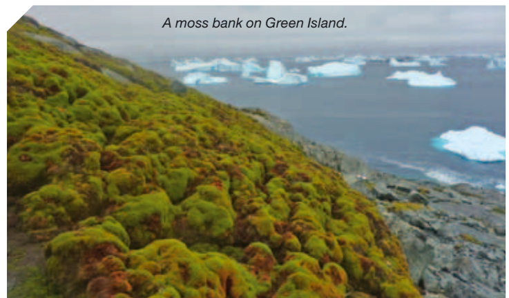
A moss bank on Green Island.

We stay four days on Green Island, often working in such wet and windy conditions that we're happy just to return to the tent to dry out and warm up each evening. In the end we collect two priceless cores as well as a range of surface moss and water samples and climate data. Since the moss banks are frozen solid from 30cm down, we have to use a modified permafrost corer to extract our