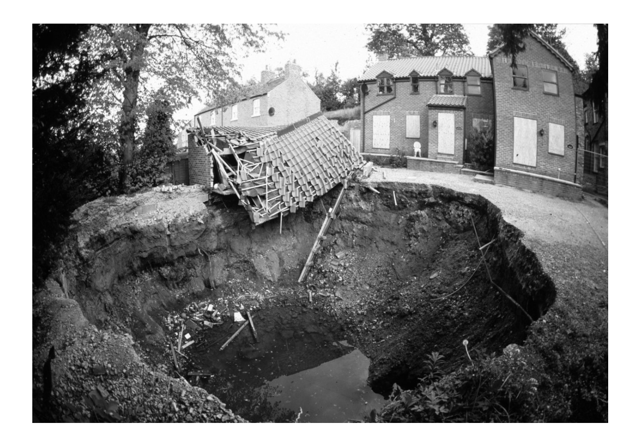
FIG. 1. The new sinkhole at Ure Bank Terrace, Ripon, looking north-east. The hole formed in April 1997, and measured 10m across and 5.5m deep. It was caused by collapse over a cave formed in gypsum of Permian age.