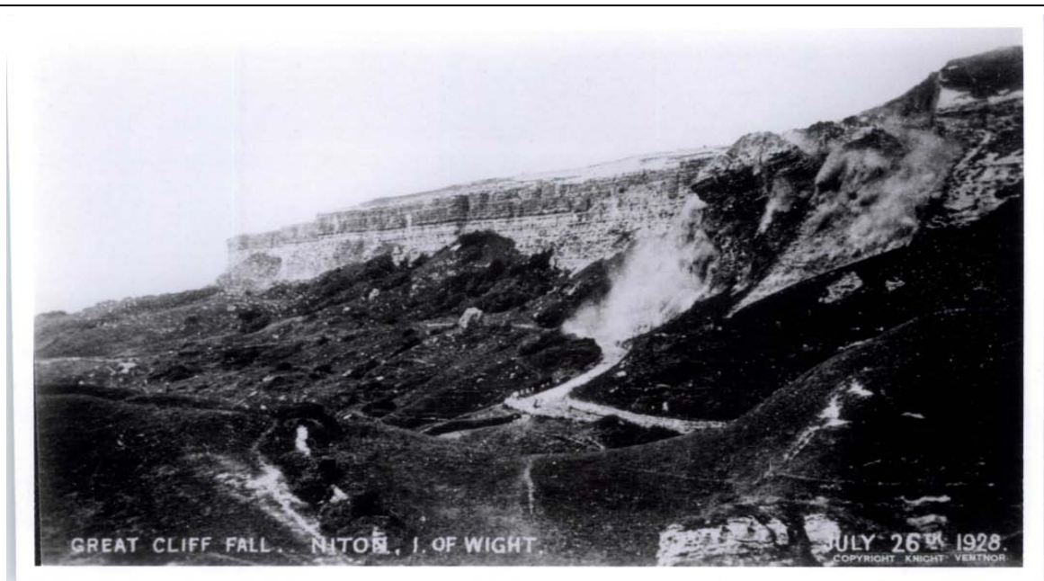
Knight's Library, Ventnor 1928

With very little noise, but gradually increasing to a roar, the vast bulk swept down to the road and disintegrated during its course into comparatively small fragments; clouds of dust arose from the sweeping torrent of stones, the full extent of which was obscured by the rising ground on my left.