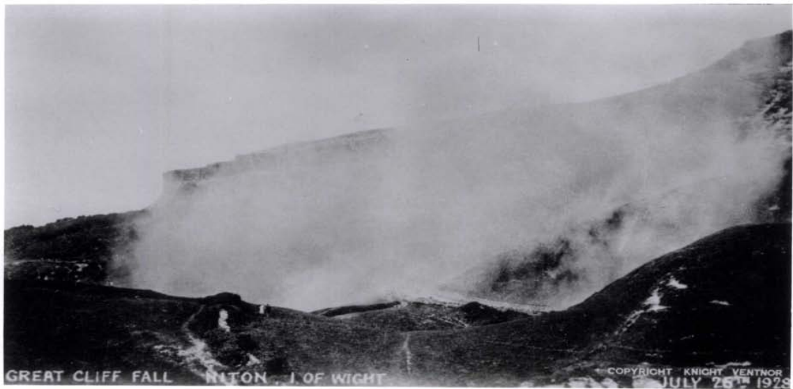
Knight's Library, Ventnor 1928

Save for a few minor movements nothing further took place that day and I hurried away to have my films developed.