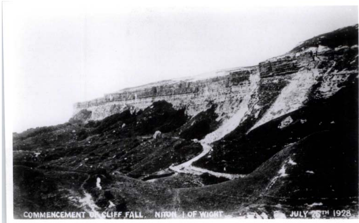
Knight's Library, Ventnor 1928

My first exposure was film, No. 1, taken shortly after 3.00, p.m.