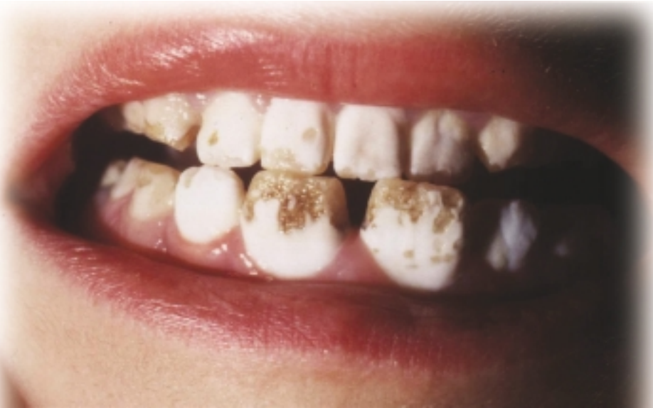
The brown pitting and staining of teeth indicative of dental fluorosis caused by high dietary fluoride intake.

which aims to improve water quality through reduction of fluoride concentrations in groundwater. The project involves partners from the Netherlands, Moldova, Ukraine, Hungary, and Slovakia.